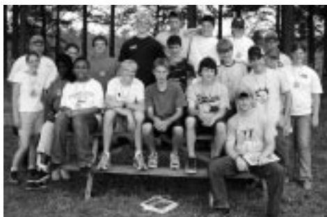
"Coming to camp has set a great impression in my life."