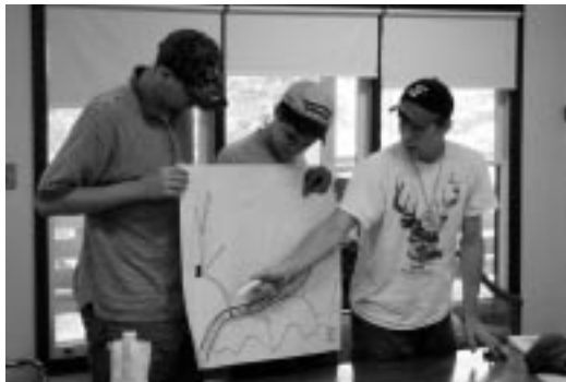
"I plan to go to college and get a forestry degree."