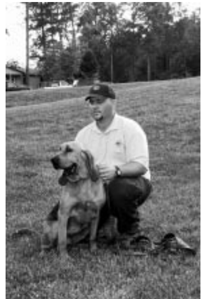
"There are so many jobs... that I had no idea even existed."