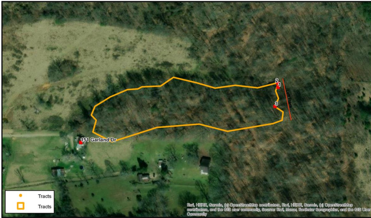
Approximate fire perimeter.

Chad Briggs (434)977-6555 chad.briggs@dof.virginia.gov 4/9/2024