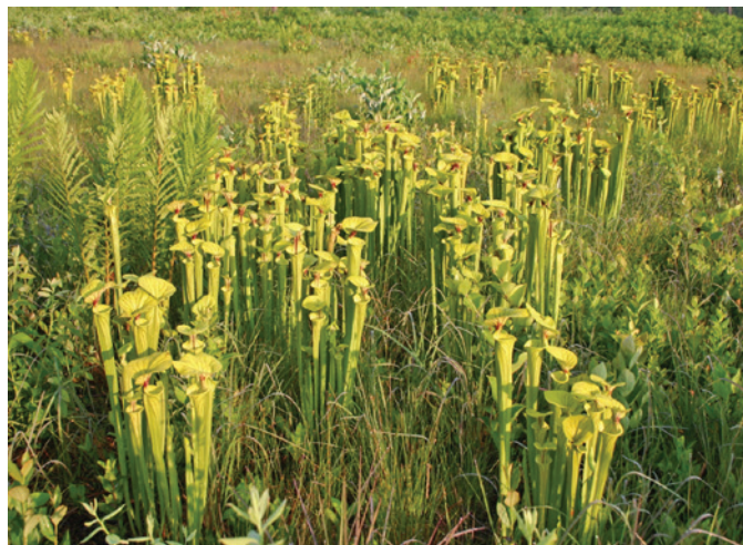
Native yellow pitcher plant at Joseph Pines Preserve

Longleaf pine forests are fire-dependent and host a number of other rare species in Virginia, including red-cockaded woodpeckers and two species of pitcher plants – a primary conservation focus for MBRS. Preserve managers have reintroduced fire to the landscape and will continue work to restore the native ecosystem through the reintroduction of at least 18 rare plant species and three rare animal species. “Preserving this habitat means we’re preventing extinction and conserving biodiversity,” says Dr. Sheridan.