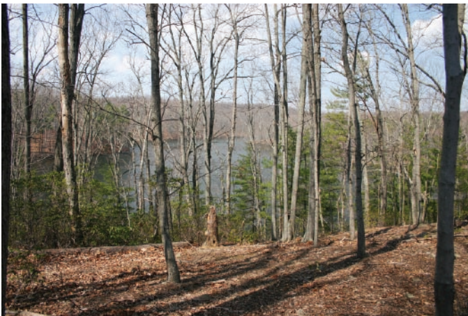
A winter day near the Charlottesville Reservoir

The trend of warmer and drier weather continued overall through the fall and winter months, although Virginia has been in far better shape than states like North Carolina, South Carolina, Georgia, Tennessee and Alabama, all of which have experienced a drought of historic proportions. November was exceptionally dry, with most areas receiving 25 percent of average monthly precipitation or less. Northern and southwestern Virginia saw the most rain, reaching levels that were 50-70 percent of the monthly average. Despite the dry conditions, significant rainfall towards the end of October and a statewide burning ban in November kept major fires to a minimum. Temperatures were actually 1-3 degrees cooler on average in the southwest, northern and coastal areas. However, the central portion of the state was slightly above average while one five-county area centered on Cumberland County averaged 2-4 degrees above normal for November.