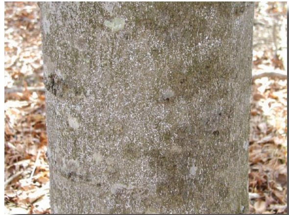
Beech scale on the surface of a beech tree

Beech bark disease (BBD) is caused by an insect-fungus complex that can severely injure or kill American beech. The fungus invades the tree through feeding wounds made by a scale insect. Both fungus and insect are thought to be exotic and were first discovered in the United States in Massachusetts in 1929. Since then, the disease has spread like a wave from the northeast southward. The active front of this wave is now about halfway through Pennsylvania. However, outlying populations of diseased trees can be found in the mountains of Virginia, West Virginia, North Carolina and Tennessee. For a while, only three counties in Virginia had reported either BBD (Highland), or the scale insect without the fungus (Bath and Rockbridge). Just in the past six months, biologists from Shenandoah National Park and the Wintergreen Foundation have reported BBD or the scale in Madison, Albemarle and Nelson counties. These new reports are very disturbing. American Beech is a very common and important species and, in many areas, is the dominant understory or overstory tree. It represents yet another native tree species facing potentially catastrophic decline.