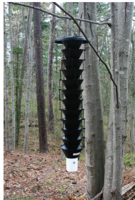
A Lindgren multiple funnel trap is a standard tool for trapping bark and ambrosia beetles.

The goal of the survey is to have a short turnaround time between trapping of these pests and having them identified by a taxonomic specialist. That way, if a new threat emerges it can be quickly acted upon before the pest problem gets away from us. The emerald ash borer and Sirex noctilio problems serve as poignant examples of what can happen with a slow response to an exotic insect. In the case of the emerald ash borer, nobody was looking for it, so it was many years after it had become established that it was even identified. In the Sirex example, this was a well-known pest of pine plantations in the southern hemisphere for decades, and there was always the perceived threat it would some day make it to our shores. When it was identified for the first time in North America, in upstate New York, it was from a trap sample collected the previous summer but not examined until the following year. Such delays in sample processing can critically impair