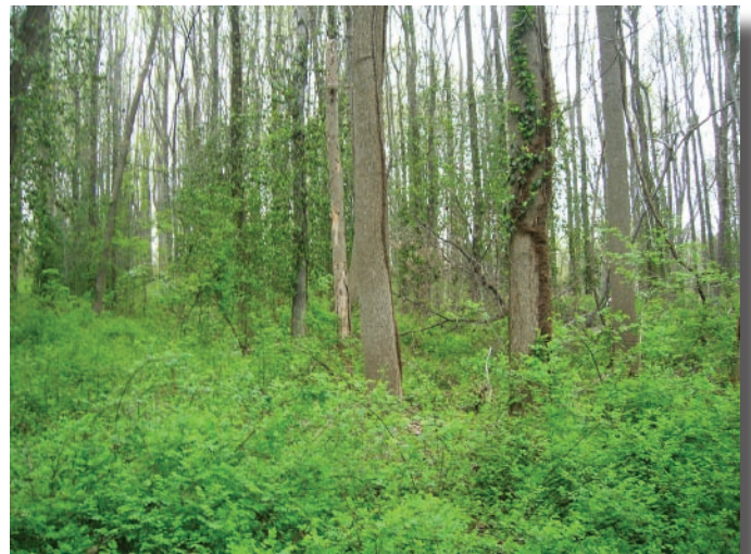
Invasive plants dominate the understory of a hardwood stand in Fairfax County.

"The man who makes no mistakes does not usually make anything."