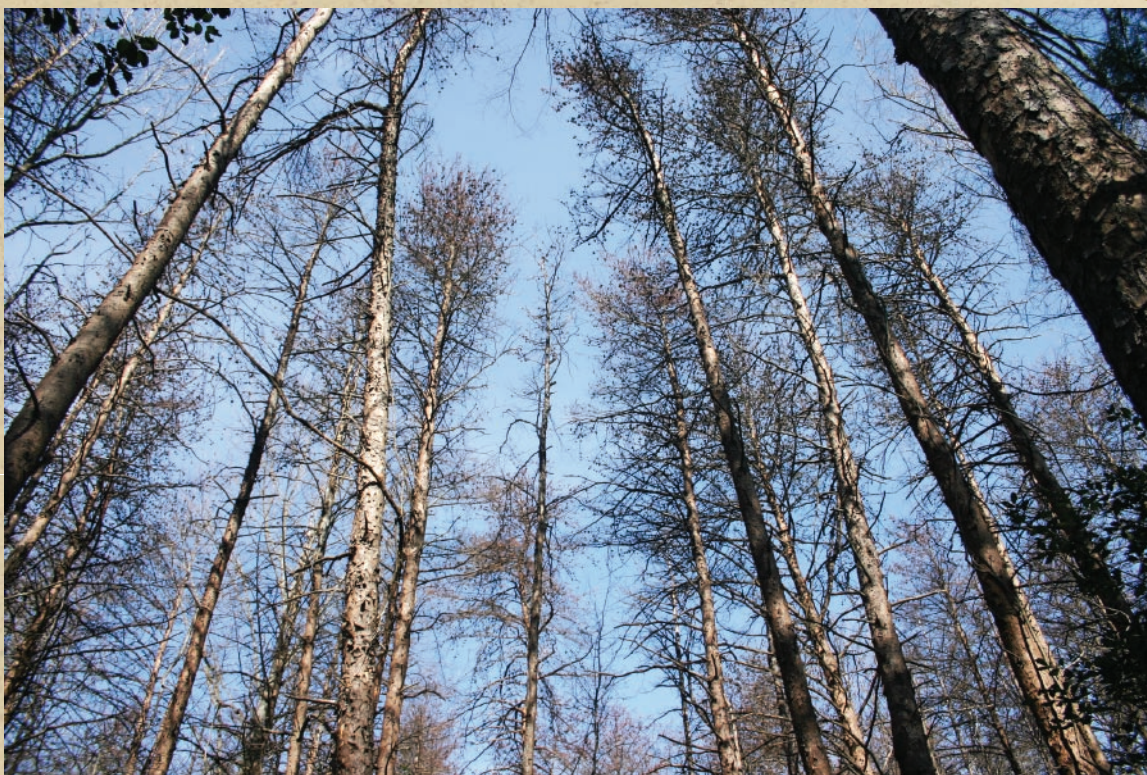
Dead pine trees within a southern pine beetle spot in Mecklenburg County.