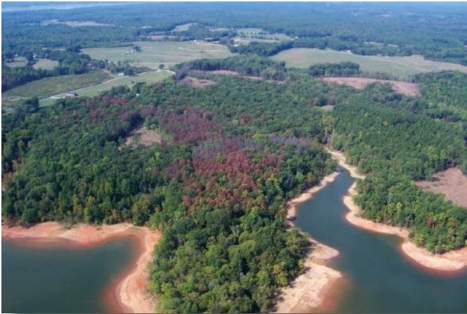
Scattered southern pine beetle spots and low lake levels are visible along the Kerr Reservoir in Mecklenburg County, VA.

is difficult to know where to begin to dig under the bark to find them. One often must wait until activity resumes in April and May and we deploy our SPB traps to forecast the outbreak potential for the coming year. So far, traps indicate elevated SPB activity in those areas experiencing problems last year, but generally low in most areas.