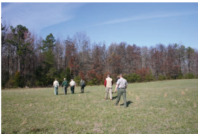
Foresters approach a large southern pine beetle spot near the Kerr Reservoir.