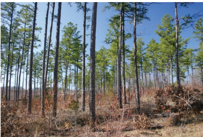
A low-density stand of shortleaf pine in Halifax County is less vulnerable to southern pine beetle.

Between 2006 and 2007, we saw defoliation due to gypsy moth increase from about 14,000 acres to 74,000 acres. We are likely to see additional increases, possibly into the hundreds of thousands of acres, unless we receive adequate rainfall between the critical period from mid-April through May when egg hatch and early larval development occur. Rainfall during this period will allow the gypsy moth fungus, Entomophaga maimaiga , to take hold on developing larvae. However, the population momentum for gypsy moth is so high right now, it would take an excessive amount of precipitation to slow them down. We will know very soon how things play out this year.