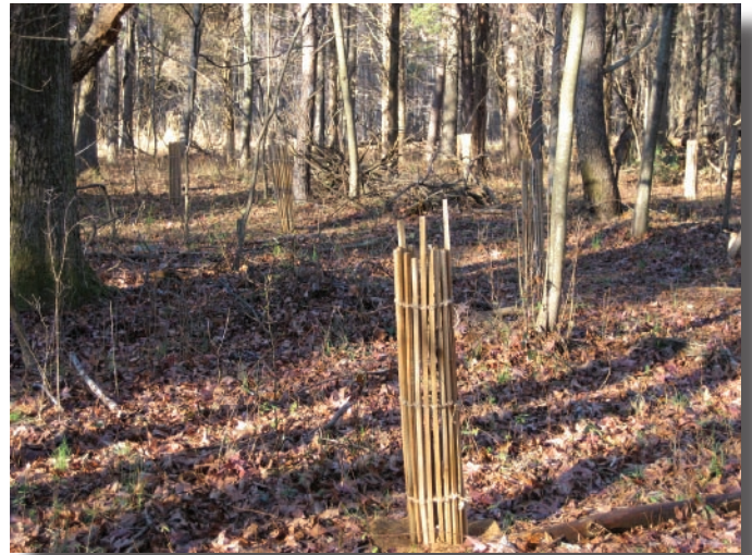
A hardwood stand with very little regeneration due to deer browse.

Invasive plants have moved into the deer-browsed forests and occupied the space they have left behind. While the invasive shrubs and herbs seem to out-