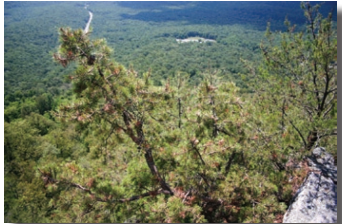
Hail damage to pines near the top of Massanutten Mountain.

of oak, pine and poplar were reported destroyed.