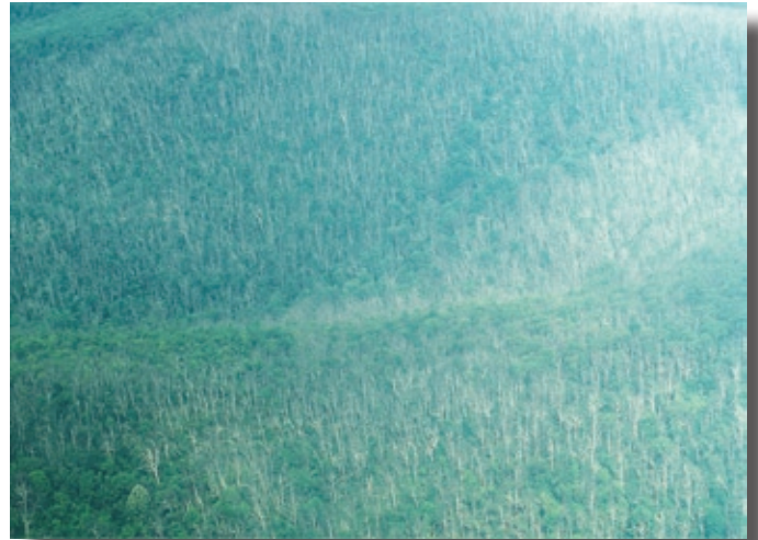
After four years of heavy gypsy moth defoliation, oak mortality reached catastrophic levels on Poor Mountain near Roanoke.

only be classified as 'light'. To all appearances, even trees that were heavily defoliated this year were able