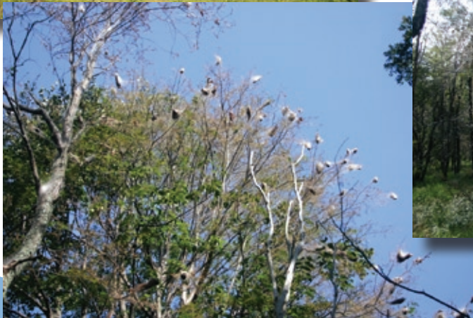
Various images of a fall webworm outbreak along Skyline Drive near Big Meadows, Shenandoah National Park. Most of the defoliated trees in the images are black cherry.

“Examinations are formidable even to the best prepared, for the greatest fool may ask more than the wisest man can answer.”