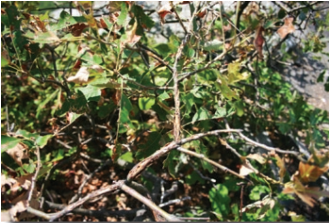
Impact of hail stones causes slits along twigs and often results in flagging.

areas of impact of hail stones. Sometimes this damage can look similar to that caused by periodical cicadas, which make slits in the bark with their ovipositor to lay eggs, resulting in flagging. In that case, however, the slits are more evenly spaced and linear than what was found here. I also bumped into a local who confirmed there had been a hail storm in the area recently. Other severe weather included a small outbreak of tornados in Campbell County in mid-July. Approximately 100 acres