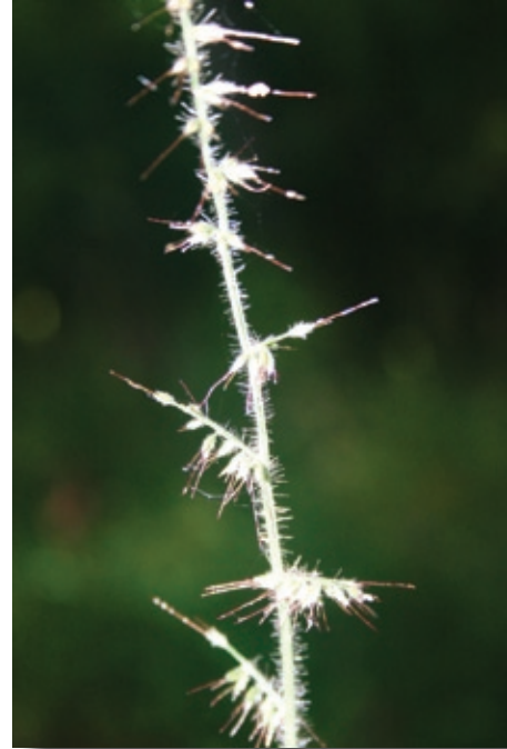
A close up of wavy leaf basket grass stalk (raceme) with sticky seed awaiting transport by a passing animal.

Be on the lookout for this new exotic so it can be eradicated before it spreads too far.