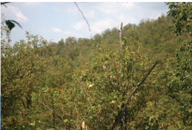
Hail damage in the foreground and background.

“Get your facts first, and then you can distort them as much as you please.”