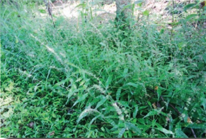
A thick carpet of wavy leaf basket grass setting seed.

It was discovered in the United States near Baltimore, MD, in the 1990s and has since been found in Virginia. The first location was near Swift Run and Route 33 on the western end of Shenandoah National Park. Efforts are underway to eradicate it using herbicides, but it is a large area. The other known location is on Ovoka Farm near Paris in northern Fauquier County. Both sites are near the Appalachian trail, suggesting it may have been moved by hikers or horses. It has also reportedly been seen in Fairfax County and is likely already pretty widespread in northern Virginia.