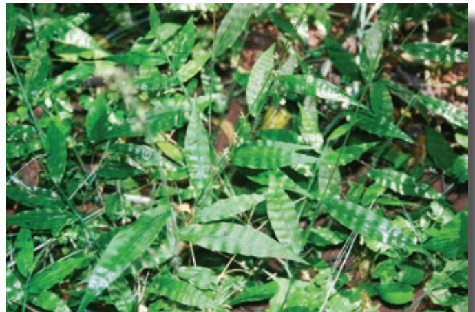
The 'wavy leaf' pattern is easier to see when foliage is wet.

A relatively new invasive weed, wavy leaf basket grass ( Oplismenus hirtellus spp. undulatifolius ) is showing up in a number of locations throughout the Commonwealth and is causing a lot of concern. Its growth and appearance are somewhat similar to Japanese stilt grass ( Microstegium vimineum ), however, the blades are a bit larger and the leaves have a characteristic 'wavy' appearance. It is extremely shade tolerant and seems to take over a site rapidly, virtually excluding native vegetation. Also, unlike stiltgrass, it is a perennial and will overtake stiltgrass when the two are growing together. It produces very sticky seed on long stalks, making it easy for a person walking through an infestation to spread the seed over long distances.