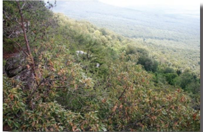
Hail damage to oaks near the top of Massanutten Mountain.

Massanutten Mountain. From the air and from the ground at a distance, it looked like gypsy moth defoliation. A closer inspection, however, revealed flagging damage to all hardwoods, pines, shrubs and other plants. Slits in the bark along twigs and branches indicated