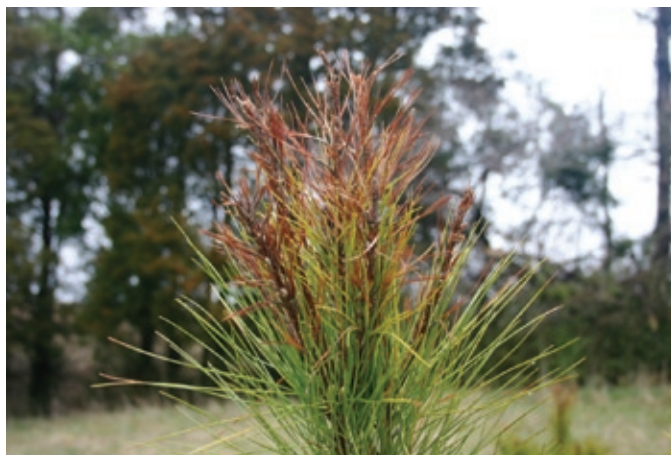
Severe damage by the Nantucket pine tip moth creates poor form and increases southern pine rotation length throughout the Southeast.

One solution to these multiple problems may be the use of systemic insecticides, particularly if control from a single application can carry over multiple generations and even years. For the past two years, Jerre Creighton and I have been testing the efficacy of two systemic chemicals for control of the Nantucket Pine Tip Moth. The first product – by Bayer Environmental Science – is called SilvaShield, which is formulated into a tablet and consists of the active ingredient imidacloprid. The second product – by BASF – is called PTM, a liquid containing the active ingredient fipronil, which is injected into the root zone. Both products are applied at or close to time of planting. Both products are also showing excellent control of tip moth damage going into the second year. Please consult the Forest Research Review for periodic updates on these research results.