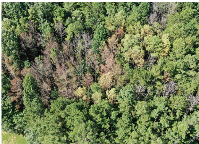
Small SPB spot in Chesterfield County

*Predictions are based on a zero-inflated Poisson model fit to historical data from 1988-2009 (Aoki 2017). The most important drivers of the model predictions are SPB trap captures in the current spring and SPB spots the previous year. The SPB prediction project is supported by USDA Forest Service: Science and Technology Development Program (STDP).