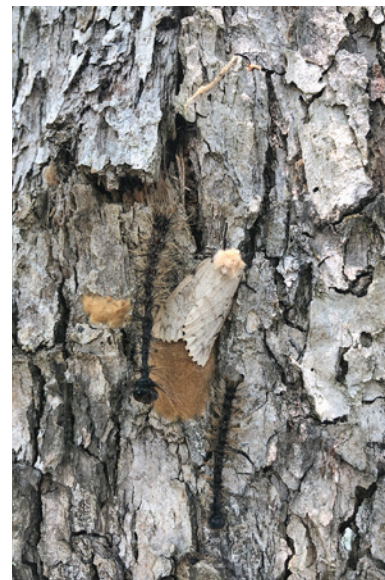
Dead L. dispar caterpillars and adult female moth laying eggs

*As of July, 2021, the Entomological Society of America no longer recognizes the common name "gypsy moth" for Lymantria dispar . A committee is reviewing submissions for a new common name.