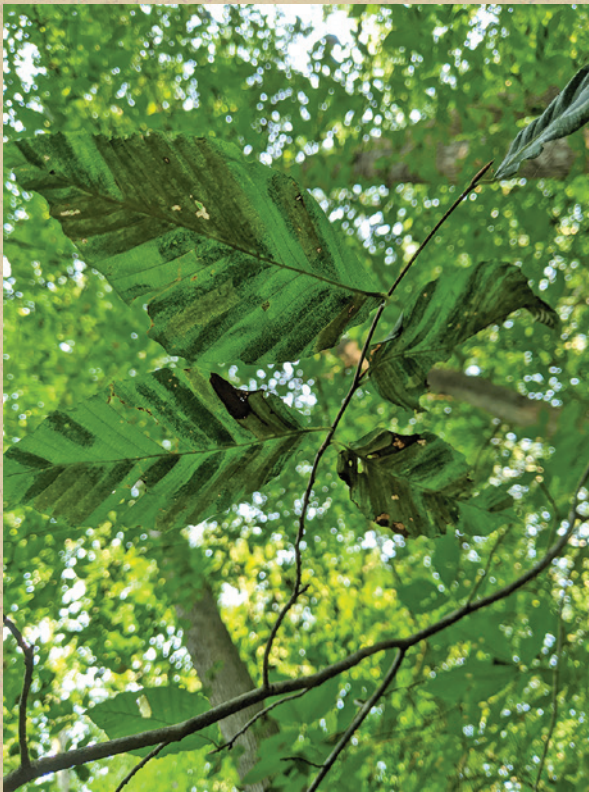
Beech leaf disease