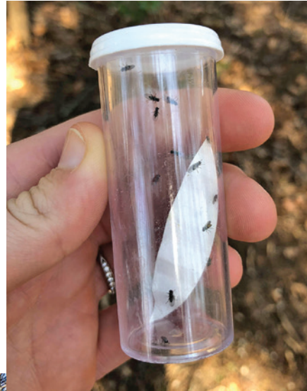
Tiny L. argenticollis flies in a vial

Forest health staff will continue to monitor HWA populations at this location and participate in recovery efforts to confirm that Leucotaraxis establishes a population at Sandy Point State Forest. Biological control has the potential to provide long-term protection for the remaining hemlocks in Virginia.