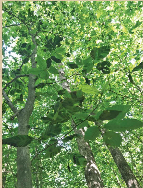
Beech leaf disease