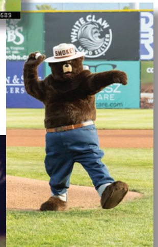
Smokey throwing the first pitch at a Salem Red Sox game