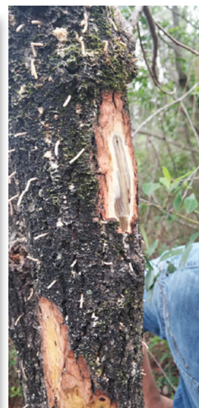
Sawdust “toothpicks” on a tree infested with the redbay ambrosia beetle