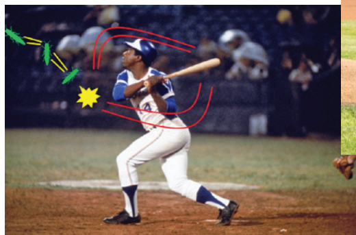
Hit EAB out of the park!