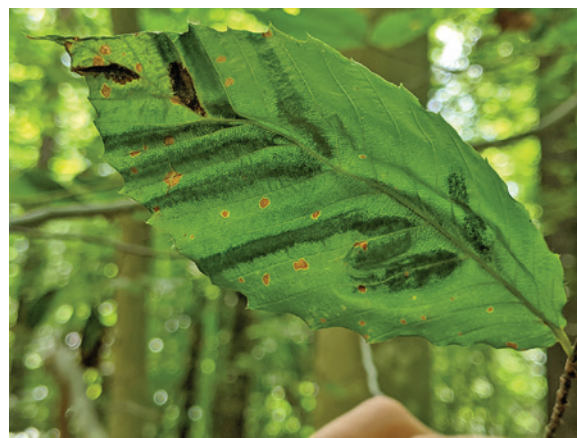
Interveinal greening on beech leaves, an early symptom of beech leaf disease