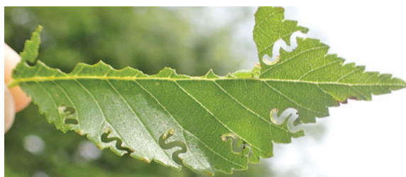
Elm zigzag sawfly larvae feeding on an elm leaf

If you think you have found the elm zigzag sawfly, please report to your local Virginia Cooperative Extension agent or local VDOF forester. Take a photo of the damage and be prepared to collect a sample. Adults or larvae may be collected and stored in ethyl alcohol. We would like to learn more about the distribution of this sawfly, and are encouraging folks to look for it and report any possible finds. The initial report was made by a community scientist, so there is a lot of potential for this type of reporting.