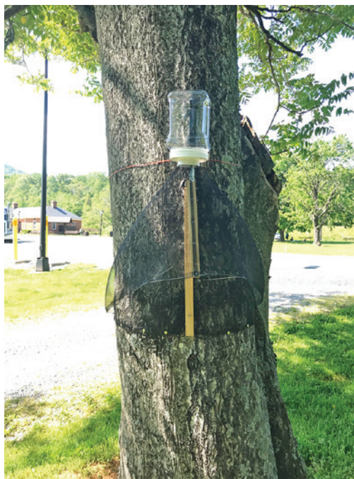
SLF circle trap on tree-of-heaven