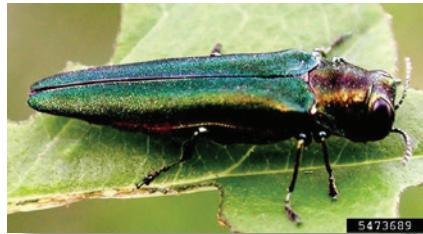
The emerald ash borer.