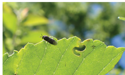
Adult elm zigzag sawfly