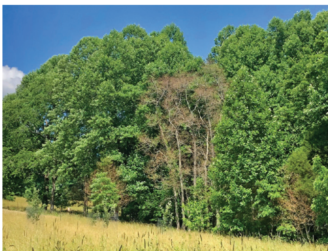
Dead sassafras along a field edge