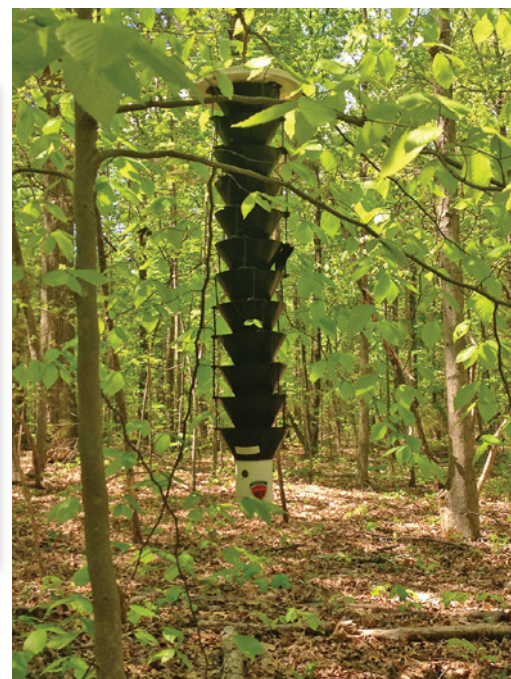
Southern pine beetle funnel trap