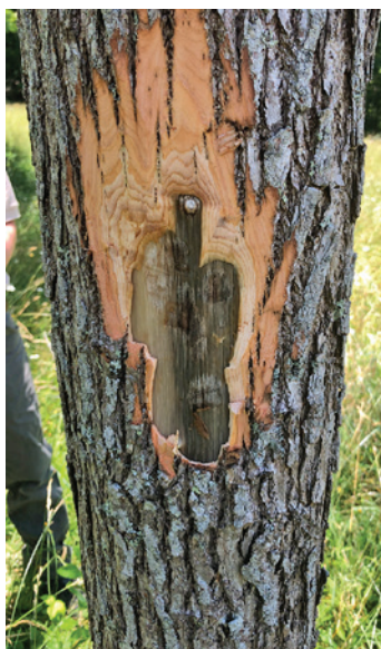
Vascular streaking in a sassafras infected with LWD

Unfortunately, there are few management options available for LWD. High-value landscape or specimen trees can be treated preventatively with a macroinjection of fungicide, but this is not practical in a forested setting. Infected trees can be chipped down to 1-inch pieces or burned to prevent the spread of this disease. If you suspect a tree has LWD, please reach out to the VDOF forest health staff for more information on how to collect a sample.