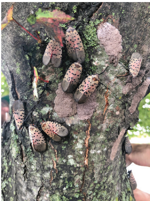
Spotted lanternfly adults and egg masses on maple tree

Researchers are investigating the potential impacts to forests; damage has been observed on many different species of trees following feeding by SLF. Even if SLF doesn't kill a tree outright, it is a source of stress, and compounded factors of stress can kill trees. The forest health staff at VDOF assists and supports efforts to slow the spread of SLF. In late winter of 2021, forest health staff and forest health liaisons conducted SLF egg mass surveys. This involved visiting high-risk sites (parks, rest areas, and parking lots) and visually surveying trees and surfaces for egg masses. These surveys occurred during the winter since SLF overwinters as egg masses and no other life stages are present. In total, there were 42 surveys conducted and no SLF egg masses found (although one surveyor did find a look-alike gypsy moth egg mass at a state park!). Additionally, from June through the beginning of September, nine SLF traps were placed at high-risk sites in central Virginia to monitor for nymphs and adults. These traps are placed on or near tree-of-heaven and catch SLF that move up the tree. Our surveys and traps did not recover any SLF, but we will continue to monitor high-risk sites in Virginia since early detection and rapid response is the best strategy. If you suspect you have found a SLF, please report to the local VCE agent or local VDOF forester.