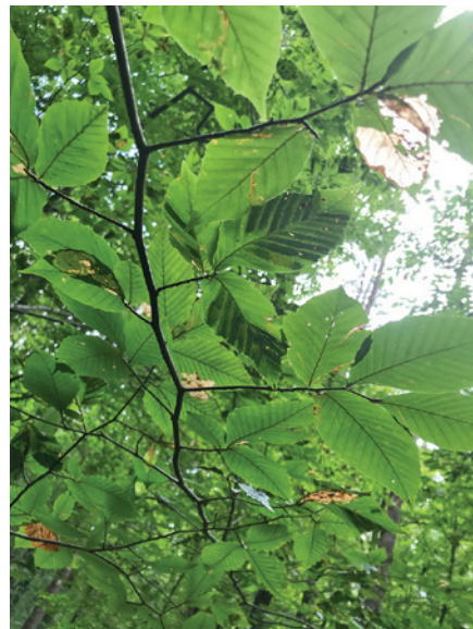
Beech tree infected with beech leaf disease

BLD has also been detected in Ohio, Connecticut, Massachusetts, New Jersey, New York, Pennsylvania, Rhode Island, West Virginia, and the Canadian Province of Ontario. In Virginia, the only known site to date is in Prince William County. If you see impacted beech trees with the symptoms listed above, please take photos and contact VDOF forest health staff at foresthealth@dof.virginia.gov .