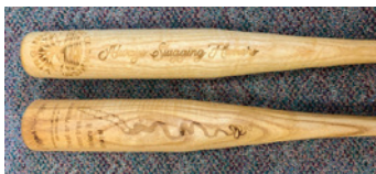
Demonstration bats made from local ash wood