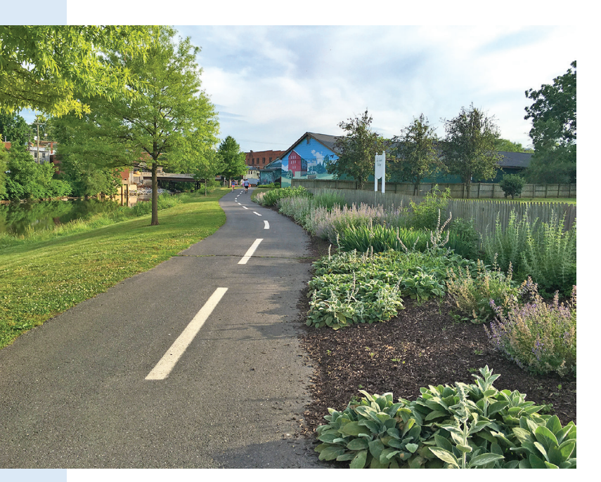
Luray Hawksbill Greenway

Additional information, funding details and requirements are available on the VDOF website.