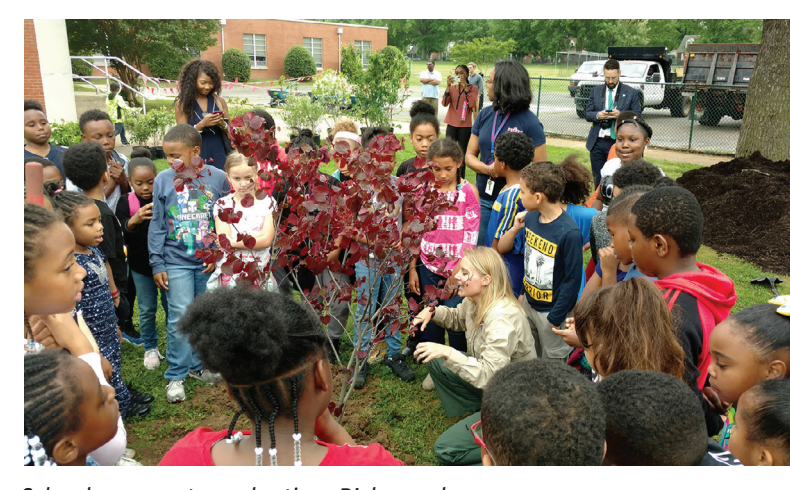
School campus tree planting, Richmond