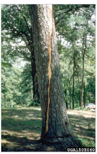
Lightning scar.