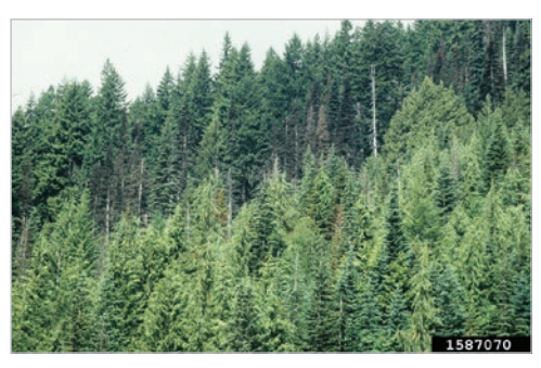
Tree mortality caused by balsam woolly adelgid.

This invasive insect is native to central Europe. It can cause significant economic damage to Christmas tree farms and nurseries.