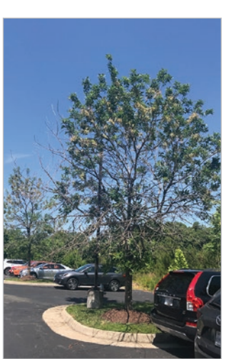
Thinning foliage or flagging are indicators of decline.