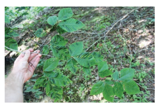
Beech leaf disease.