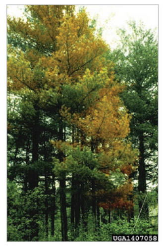
Salt-burned pines will drop damaged foliage and resprout new needles at a later

Trees exhibiting signs of salt injury should be watered and mulched to decrease the likelihood of additional stress. Prune damaged branches from the tree to prevent attracting insects and disease. Some species are more tolerant of salt than others. Any trees that are particularly sensitive should be planted away from salt spray drift zones and slush-accumulation areas. Irrigate soils to leach salt out of the root zones and apply gypsum to displace sodium concentration.