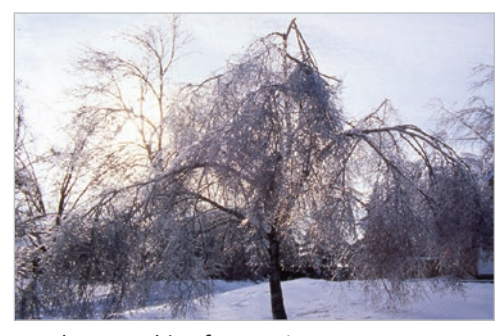
Breakage resulting from an ice storm.