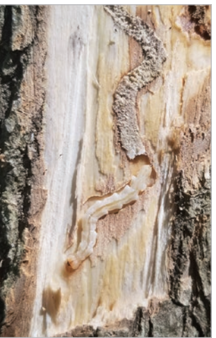
Emerald ash borer larva and S-shaped gallery.