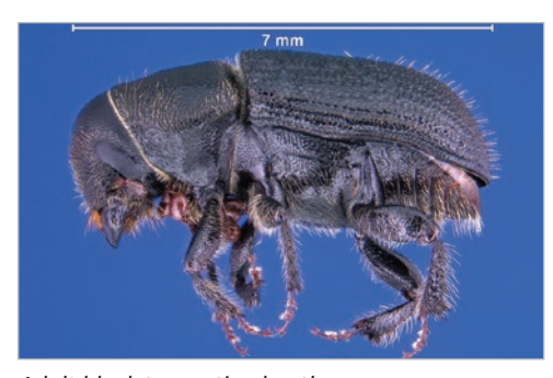
Adult black turpentine beetle.

Keeping trees healthy with proper forest management is the best prevention. Avoid mechanical injury to trees during logging operations or prescribed fires. In large infestations, remove wounded trees to stop the population from spreading. Insecticides may be applied to the main stem of infested and adjacent uninfested trees.