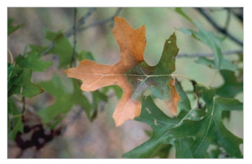
Foliar symptoms of oak wilt.