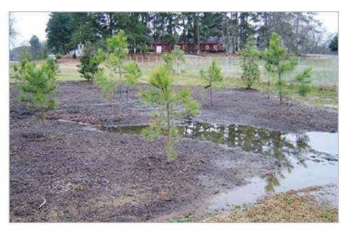
Newly-planted pine trees sitting in oversaturated soil.