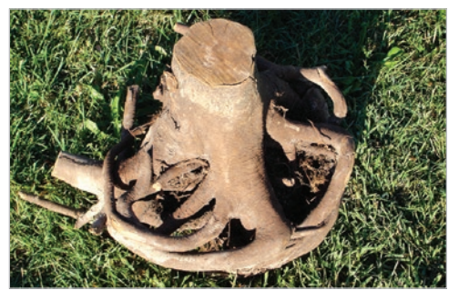
Circling roots evident following removal.