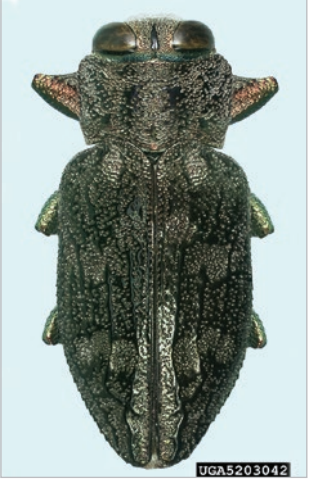
Adult flatheaded appletree borer.