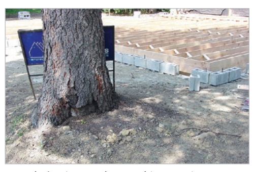
Foundation is very close to this maturing tree.