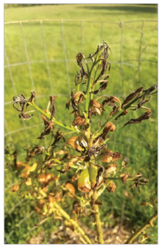
Leaf dieback due to cold injury.