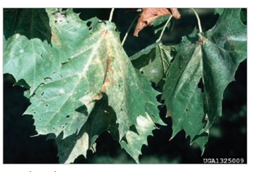
Lace bug damage.

Inspect trees in the early spring for adults, eggs, and nymphs. Control measures should be applied in the early spring, during the development of the first generation of lace bugs. If populations are low, simply wash them off with water. Repeated applications of insecticidal soaps or horticultural oils are effective in controlling moderate lace bug populations. If the infestation is heavy, chemical sprays may be necessary, but should be limited to protect natural enemies.