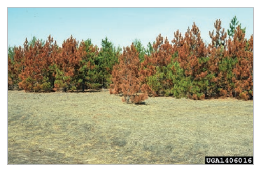
Diplodia tip blight damage in a pine plantation.