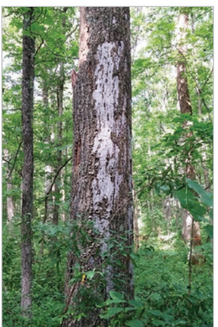
Biscogniauxia on a dead tree.

This disease used to be called hypoxylon canker. It is a contributing factor in oak decline.