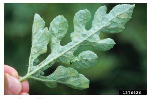
Powdery mildew.

In areas where powdery mildew frequently develops, prune trees and mow grass to increase air circulation and reduce shading. Remove infected leaves and stems, and prune suckers if present. Use of fungicides is usually not necessary, but they can be effective if applied at the first sign of infection.