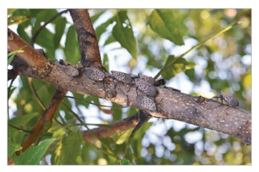
Spotted lanternfly adults.

This is a serious invasive pest that is currently under quarantine, and sightings should be reported. If you think you've identified spotted lanternfly in your area, contact your local extension agent and VDOF Forest Health staff.