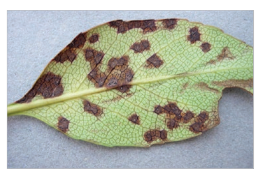
Leaf spot on a leaf.