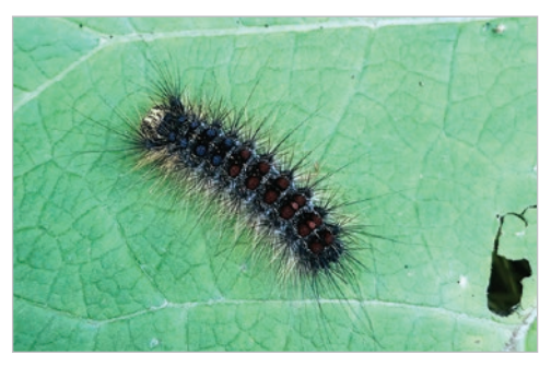
Gypsy moth caterpillar.