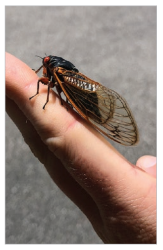
Adult periodical cicada.