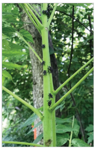
Spotted lanternfly nymphs.