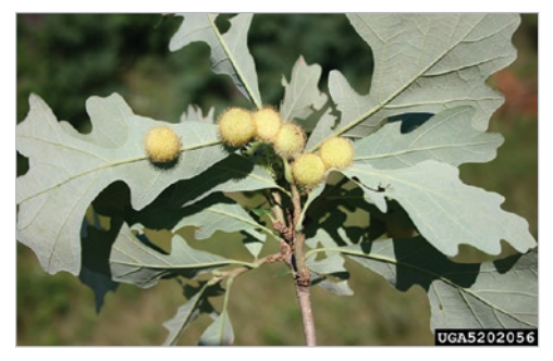
Gall wasp damage on foliage.