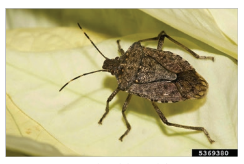
Brown marmorated stink bug adult.

Some species of stink bugs are native to Virginia. The brown marmorated stink bug, however, is an introduced species from Eastern Asia, first discovered in the United States in the early 2000s.