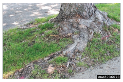
Roots too shallow will experience repeated damage over time.

out to the dripline. Mulch will conserve water, reduce compaction, and inhibit the growth of weeds or grass near the base of the tree. Any grass or weeds at the base of the tree should be removed by hand or with grass shears. Be mindful when using lawn maintenance equipment and give ample space. When planting a tree or shrub, keep in mind the need for future maintenance. A younger tree or one with thin bark is especially susceptible. Young trees can be protected with tree tubes or sections of corrugated pipe.