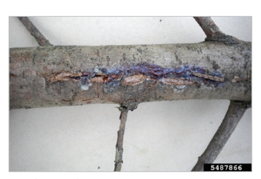
Seiridium canker.

Because spores germinate in wet weather, this disease thrives in dense canopies that are damp and shady. To preventatively discourage fungal growth, prune limbs and thin trees to increase air circulation and sunlight. Remove diseased branches from infected trees. Do all pruning in dry weather to prevent spores from dispersing. Maintaining tree health will increase vigor and help the tree resist infection. In conjunction with cultural practices, broad-spectrum fungicides and growth regulators can help protect new foliage from infections.