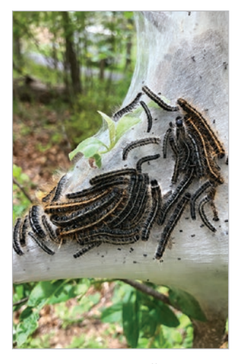
Eastern tent caterpillars.