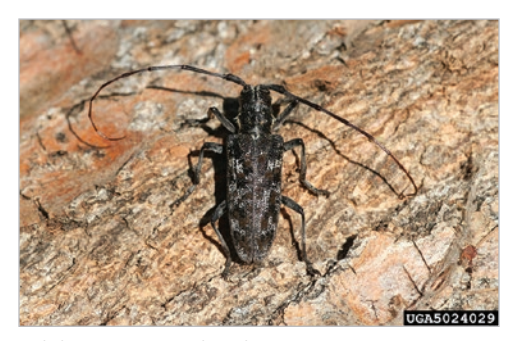
Adult pine sawyer beetle.

Larvae are known as roundheaded wood borers and frequently make loud clicking noises while they feed underneath the bark.