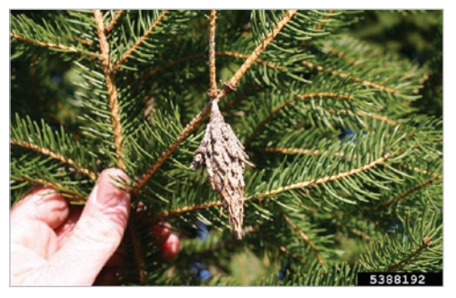
Bagworm bag created with silk and host foliage.