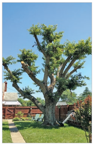
Watersprouts form in response to severe reduction cuts.