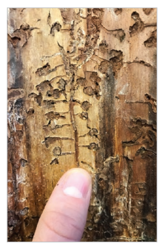
Ips bark beetle galleries.