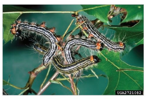
Yellownecked caterpillar.