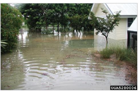
Standing water depletes the soil of oxygen and can introduce pathogens.