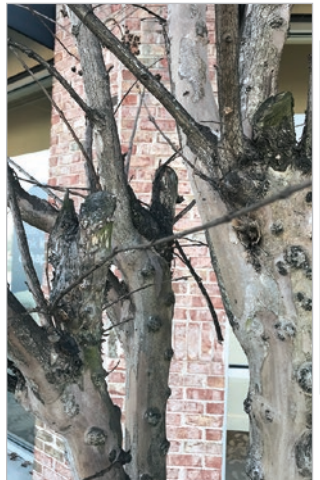
Years of poor pruning practices on a crape myrtle.