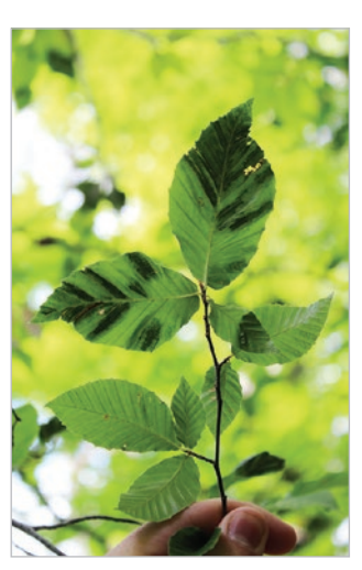
Striping on leaves infected with beech leaf disease.

At the time of publication, beech leaf disease had not yet been discovered in Virginia.