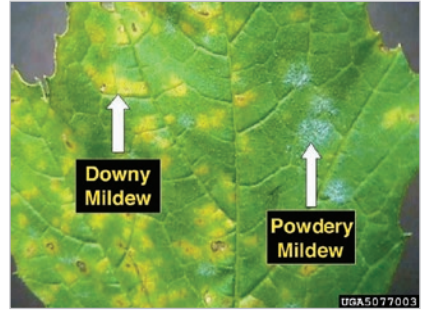
Comparison of downy and powdery mildew.