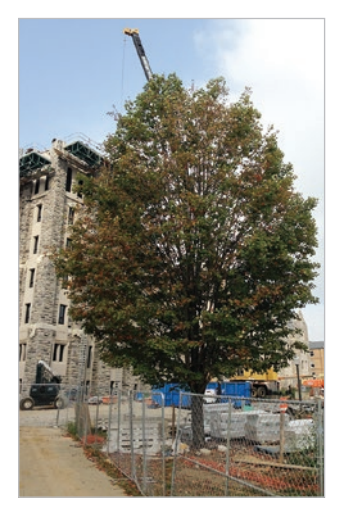
Construction activities compact the critical root zone.

Perform a preconstruction evaluation to determine which trees to remove, prune, relocate, or preserve. Follow ANSI 300 standards Part 5 for tree preservation. Roots that are encompassed within the dripline are crucial to a tree's survival. Mark the critical root zone (CRZ) with signage to help ensure that no construction occurs in these areas. Prior to and following construction, mulch the CRZ and make sure the tree has been well watered to minimize stress. If tree is damaged during construction, invite a certified arborist to evaluate the tree. Not all trees can be saved but with proper planning and monitoring, careless mistakes can be avoided.