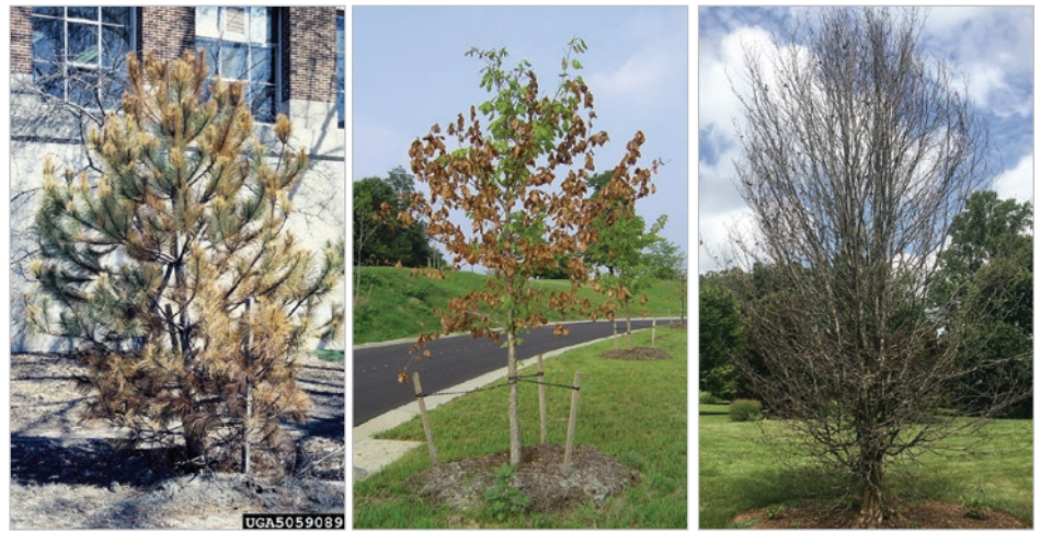
Browning pine needles.