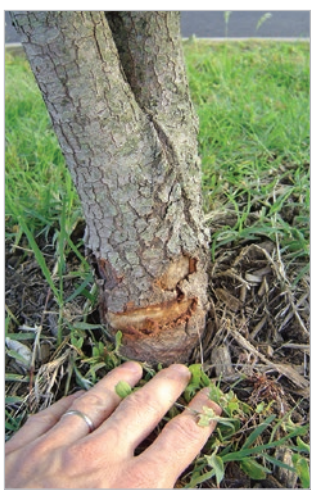
Wounds expose trees to decaycausing fungi.