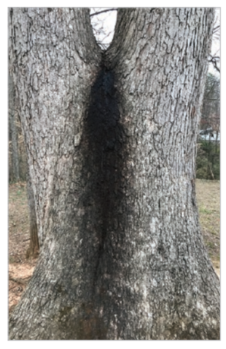
Discolored wood from bacterial wetwood.