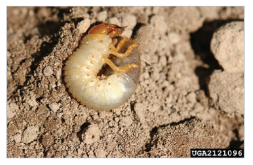
Larva of a June beetle.