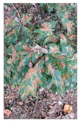
Leafminer damage on oaks.

Most damage is cosmetic with no significant harm to the tree. Control is usually not warranted as natural enemies control leafminer populations. Insecticide options are available but require correct timing and precise identification of the leafminer species.