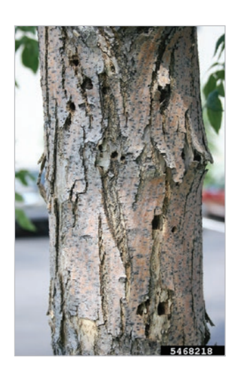
Circular exit holes on trunk from lilac borer.

This pest is difficult to eradicate once it is established. Prevention is the best management method because lilac borers attack stressed trees. Prune older limbs near the base of potential host trees in the winter before adults emerge. Pheromone traps can be used to monitor adult flight. Insecticidal sprays can be applied in early May and again six weeks later to kill emerging as well as entering borers; larvae are protected from sprays once they have tunneled into the bark. Thorough wetting and soaking of the bark is necessary; foliage does not need to be treated.