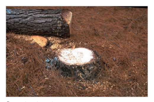
Borax treatment.

Formerly known as annosum, annosus root rot, or fomes.