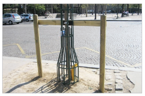
Urban trees planted in tree pits are compacted by both pedestrian and vehicle traffic.