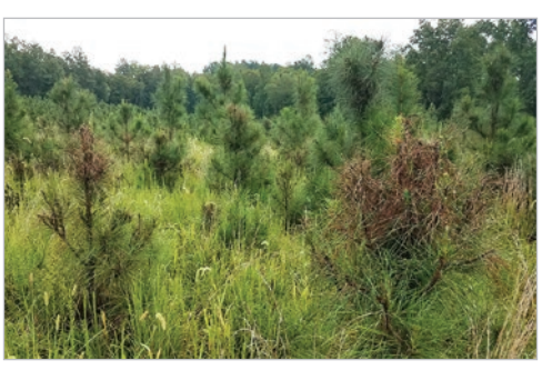
Damage to young pine caused by tip moth.