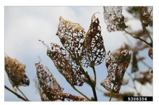
Foliar damage by Japanese beetles.