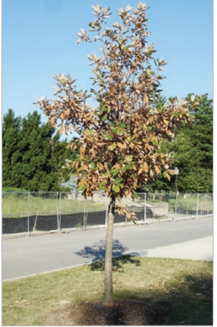
Discolored wilting leaves from drought.