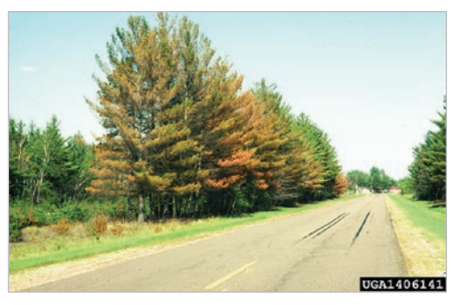
Pines along a busy roadway exhibit brown needles due to de-icing salt applications.