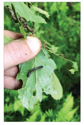
Fall cankerworm caterpillar.