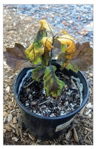
Fertilizer damage to northern red oak.

Overapplying fertilizer can alter the pH and salinity of the soil. Before applying fertilizer, perform a soil test to determine exactly what nutrients are lacking. Often natural soil amendments, such as compost, can be added in place of fertilizers. If fertilizers are needed, a slow-release organic fertilizer is less likely to cause plant damage. Always follow the label regarding directions for application. Do not fertilize newly-planted trees.