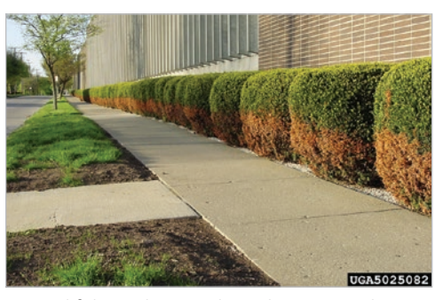
Burned foliage due to salt applications on busy sidewalks.

date.