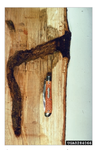
Carpenterworm tunnels.

Beneficial nematodes Steinernema feltiae or S. carpocapsae can be used as biological control agents. Apply nematodes with a squeeze-bottle applicator by inserting the applicator nozzle into each gallery after clearing frass from the tunnel entrance. Insecticides are not effective against larvae inside the tree and should only be used to control adults. Insecticides labeled for trunk and bark treatment may provide control if appropriately timed. Monitor trees beginning in late winter and spray bark when the first pupal cases appear.