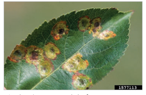
Discoloration on an apple leaf.