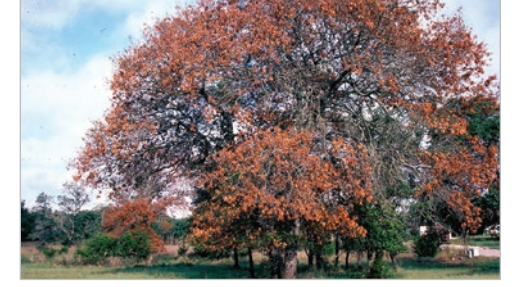
Tree mortality from oak wilt.

Oak wilt is an aggressive disease and a serious threat to oaks in eastern United States. Although oak wilt was confirmed in western Virginia, it has not been detected again in Virginia for decades.