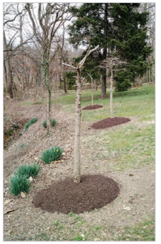
Excessive pruning.