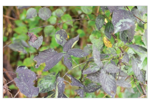
Sooty mold on foliage.