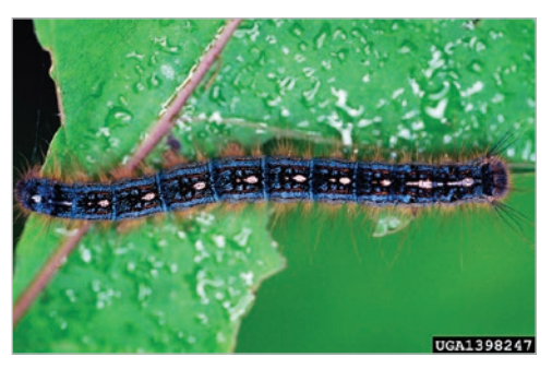
Forest tent caterpillar.

The forest tent caterpillar is often confused with the eastern tent caterpillar. Forest tent caterpillars have a brownish body with pale blue lines along the sides and white keyhole- or footprint-shaped spots running down their back.