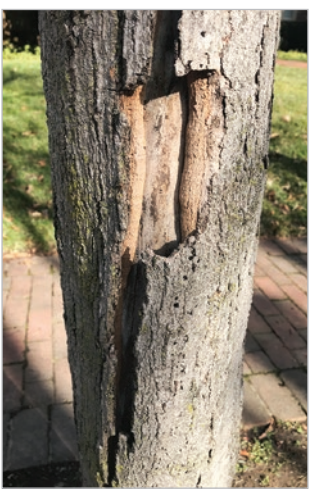
A tree is unable to close a large wound after extensive frost cracking damage.