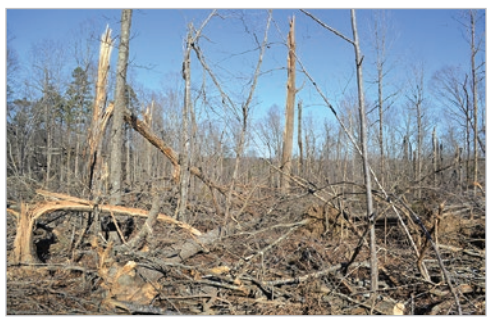
Tornado damage at Holiday Lake State Park.