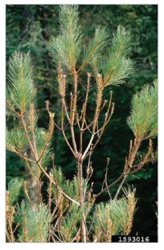
Redheaded pine sawfly damage.

There are many species of pine sawflies in Virginia including the redheaded, introduced, European, and Virginia pine sawfly. While sawflies look like caterpillars, they are actually the larvae of a stingless wasp.