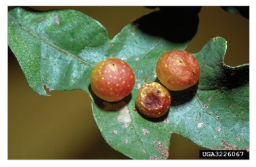
Cynipid gall.

Most gall insects have only one host plant, and can be identified based on gall shape and the host plant.