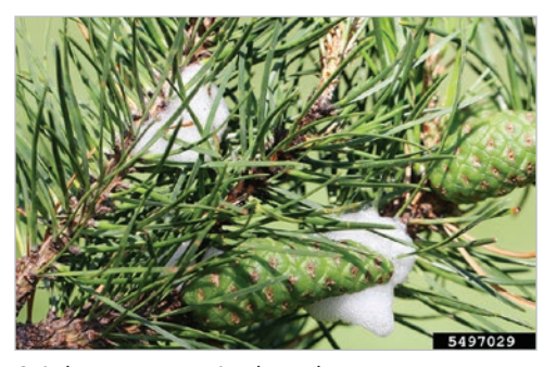
Spittle masses on pine branch.