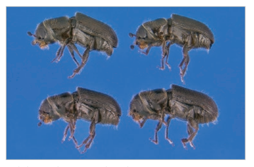
Adult southern pine beetles.

The southern pine beetle is the most destructive native forest pest in the southern U.S. It generally attacks trees that are already stressed but can overcome healthy trees in high populations.