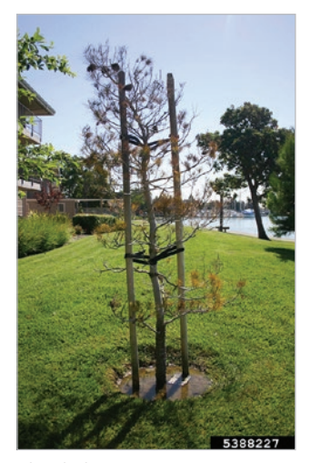
Flooded pine.

Trees are especially susceptible during the growing season. Inspect trees after flooding water has receded. It may take several months for symptoms to show. Remove dead, dying, and broken branches but only prune trees during dormant season to reduce the likelihood of infection and pest infestation. Remove deposited sediment from the base of the tree and aerate the soil. Add mulch to eliminate weeds and conserve moisture. Continue to monitor the trees for a full planting season as some effects can be delayed. As with any tree – a tree that is healthy before the flooding occurs has the best chance of recovering. Any trees that are partially uprooted need to be removed by a professional arborist. Plant flood-tolerant species native to riparian environments and swamps in flood-prone areas.