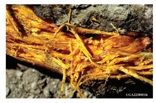
Stringy resin-soaked roots.