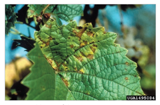
Downy mildew on foliage.

Although similar in name, downy and powdery mildews are distinct diseases caused by different organisms. Downy mildew produces greyish fuzzy spores on lower leaf surfaces while powdery mildews produce white flour-like colonies on upper leaves. Send samples to a plant disease clinic for confirmation.