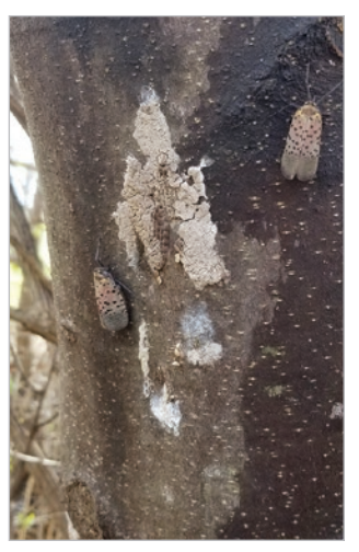
Spotted lanternfly egg masses.