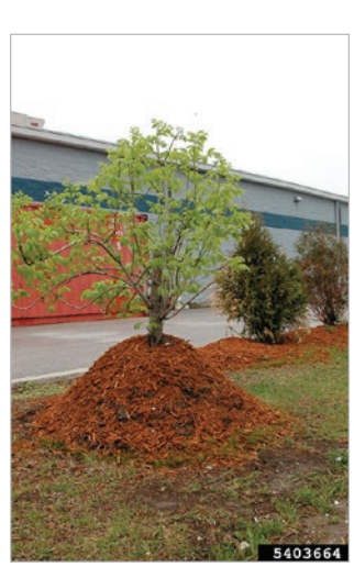
Excessive mulching buries the trunk of a tree.

Pull mulch 1 inch away from the stem of the tree to let air circulate near the base. Extend mulch out towards the dripline of the tree. Ensure the mulch is the proper thickness (roughly 2 to 4 inches) to dissipate compaction and hold moisture.