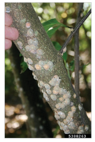
Magnolia tree scale.