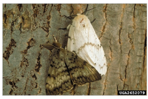
Gypsy moth male (left) and female (right) adults.