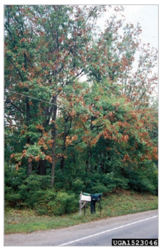
Flagging caused by cicadas.