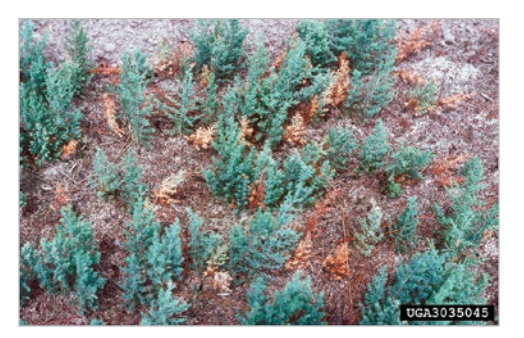
Juniper tip blight damage.

Prune and destroy infected twigs and branches in dry weather but avoid over-pruning and generally wounding the tree. Sanitize pruning equipment between cuts. Avoid planting seedlings too close together; wider-spaced planting promotes air circulation and makes the environment less favorable for disease. Fungicide control is effective when used in conjunction with the cultural controls described above.