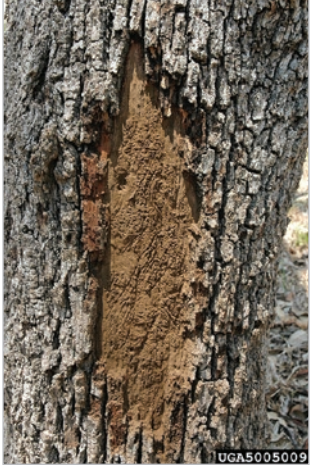
Early brown fungal mat.