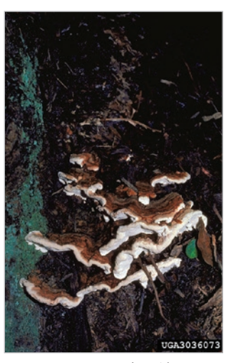
Fruiting structure (conk) at the base of a tree.