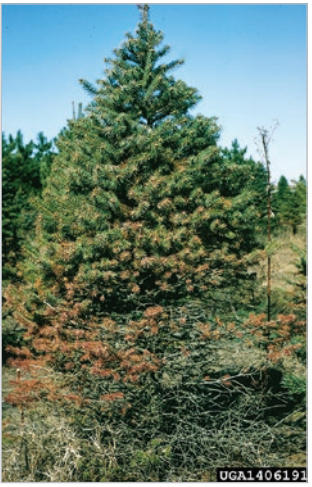
Rhizosphaera needle cast damage on tree.