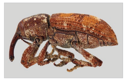
White pine weevil.

In spring, look for resin drops on the leader and look for curled terminal leaders in June. Infested leaders should be pruned and removed before midsummer to stop the life cycle of the pest. Prune all but one live lateral shoot just below the damaged terminal. This should promote single-stem dominance on the affected host plant. Application of a registered insecticide should be made to the impacted terminal leader in early spring before buds open.