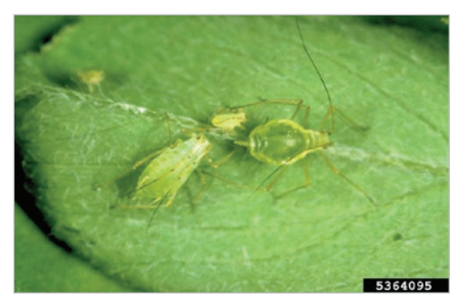
Adult aphid with immature aphids.