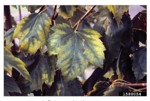
Magnesium deficiency displays as interveinal chlorosis on older leaves.