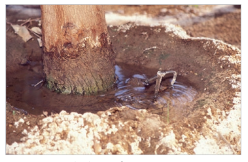
Water sits at the base of a tree causing rot.