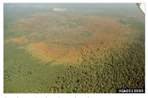
Southern pine beetle outbreak.