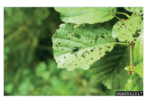
Adult elm leaf beetle and damage.

There are many leaf beetles in the family Chrysomelidae . The elm leaf beetle and the larger elm leaf beetle are common Chrysomelid pests of elm in Virginia.