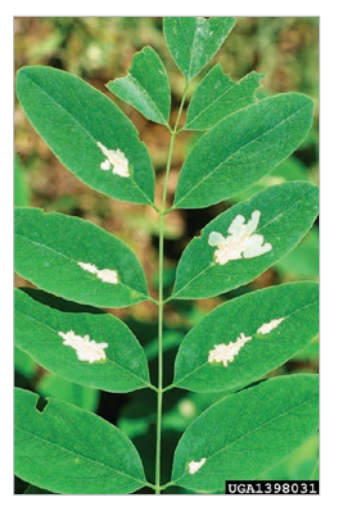
Locust leafminer damage on foliage.

help control populations of locust leafminers and therefore other control methods are generally not warranted.