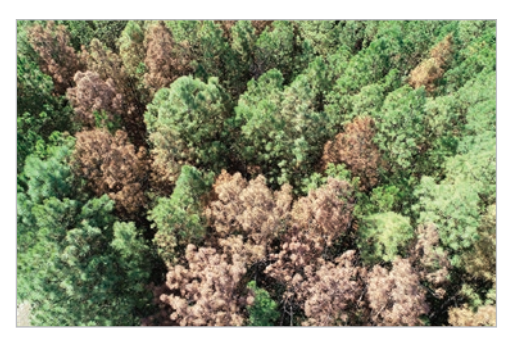
Ips bark beetle damage.