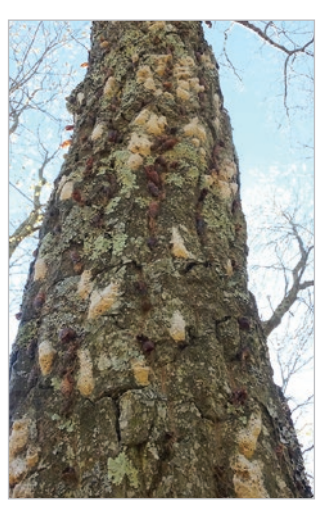
Gypsy moth egg masses and pupal casings.