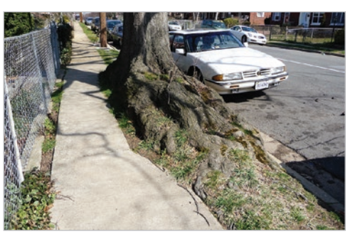
Constricted roots will find various places to grow including under paved infrastructure.