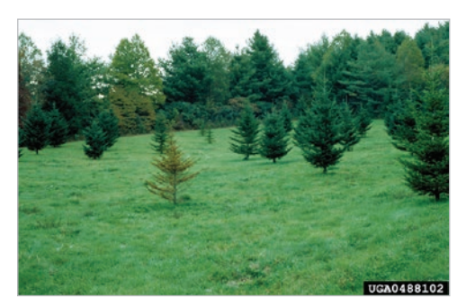
Trees impacted by phytophthora root rot.

Phytophthora root rot is the general name for root diseases caused by species of water molds in the genus Phytophthora. A water mold is like a fungal spore but with a tail (flagellum), which it uses to move through water.