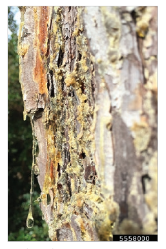
Pitch canker resinosis.