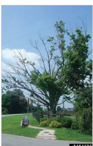
Gradual canopy decline along one half of the tree.

A combination of numerous factors ultimately lead a tree into decline. If a specific problem can be identified, follow targeted treatment recommendations for that stressor. Once a tree exhibits multiple signs that it is in a spiral of decline, the best course of action may be to remove the specimen and plant a new one.