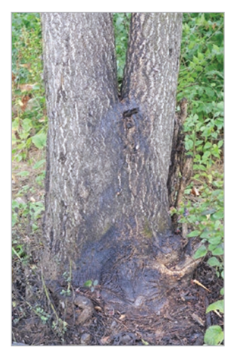
Sooty mold.