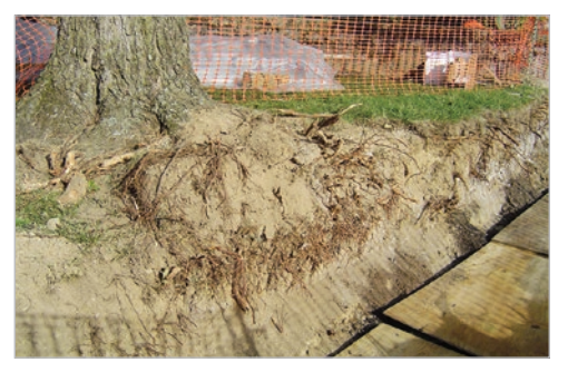
Severed root zone will cause extensive dieback and decline over time.