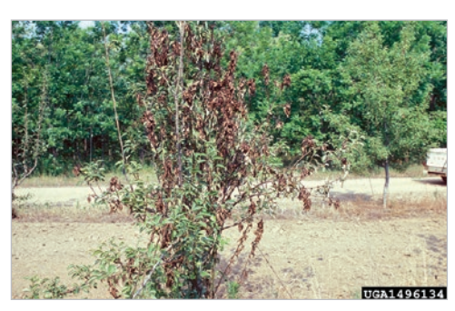
Damaged foliage on tree infected by fire blight.

Fungicides can be effective during bloom as a preventative treatment. Mechanical management involves pruning infected branches. It is recommended to prune 8 inches below cankerous/diseased tissue in the spring and summer but avoid pruning when plants are wet and sanitize tools after each cut. Reduce stress on plants through proper care.