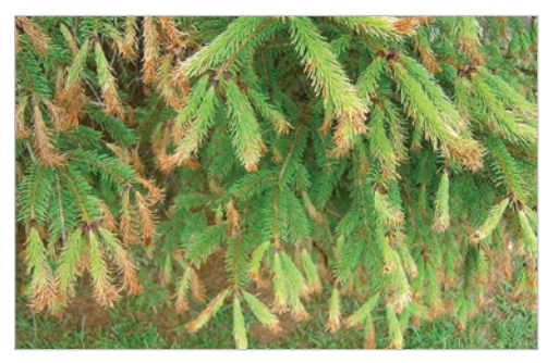
Spruce tip burn.