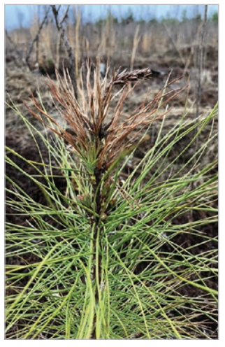
Dead shoot from tip moth feeding.

is applied when larvae are young. Treat with a contact insecticide in April and make sure to thoroughly wet all needles and shoots. Repeat application one to two times at 8-week intervals, preferably with a systemic insecticide.