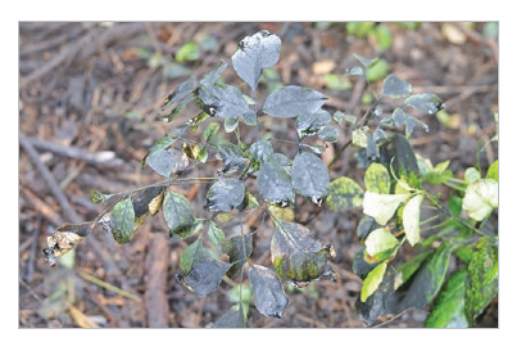
Sooty mold on foliage.

If sooty mold is fresh, it may be possible to wash off the honeydew on which it is growing. However, the sooty mold will likely reappear if steps aren't taken to control the insects producing honeydew. Inspect for insect pests and honeydew both on the affected plant and in the overstory, as honeydew can drip from above down to the understory if infestations are heavy enough. Horticultural oils can be used to control insect populations and loosen honeydew from the plant surface. Aphids, mealybugs, and whitefly populations can also be controlled with the appropriate insecticides. Insect species must be identified before determining the appropriate insecticide for treatment.