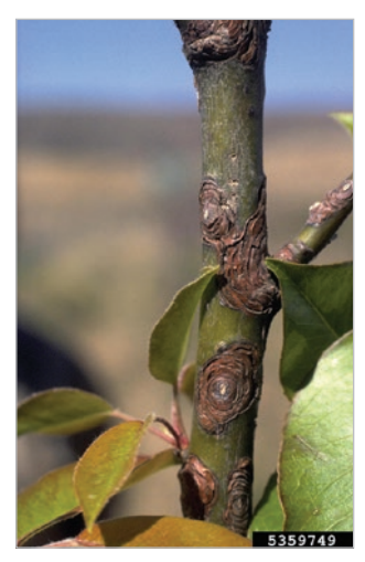
Nutrient deficiency or toxicity disfigures buds on an apple tree.

Perform a soil test to determine what nutrient(s) are missing from the soil. Soil amendments or foliar applications can be applied to mitigate the issue. Avoid overwatering and compaction.