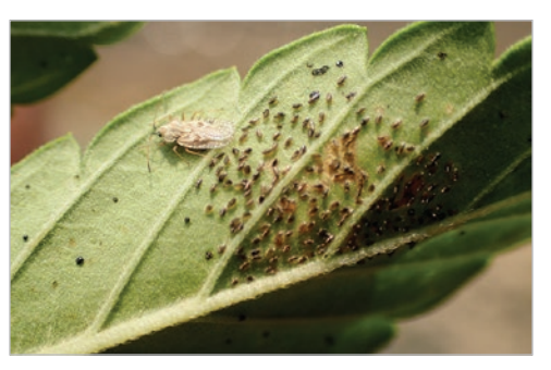
Adult lace bug with nymphs.