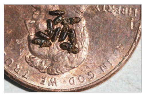
Walnut twig beetles.