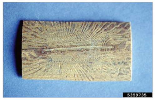
Beetle galleries from insect vectors.

Remove diseased trees and sever root grafts between trees. If only a few branches show symptoms, prune limbs at least 5 feet below the last sign of streaking. Do not transport firewood. Either burn wood immediately or remove bark and cover in airtight plastic for one year. If diseased tree is highly valued, fungicides can be applied yearly and may save tree if infection is caught early enough. Plant resistant elm tree varieties.