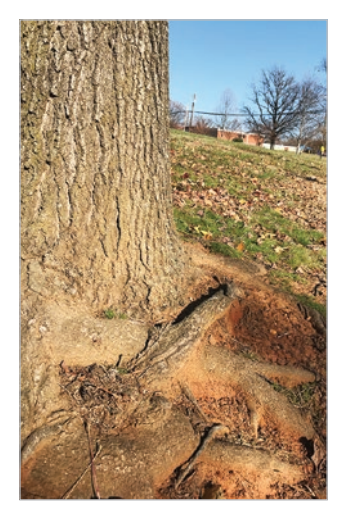
Girdling roots cause constriction along the base of a tree.

It is best to correct girdling roots at the time of planting, or plant stock without girdling roots. If the tree has already been planted, excavate around the base of the tree and sever any small circling roots at the trunk. Remove the entire root if there is no threat to injuring the cambium or trunk. Large, circling roots may need to be removed in stages due to the amount of water and nutrients they supply the tree. Removing in stages will allow the tree time to produce new roots and reduce the likelihood of shock. Any dieback should be removed from the tree.