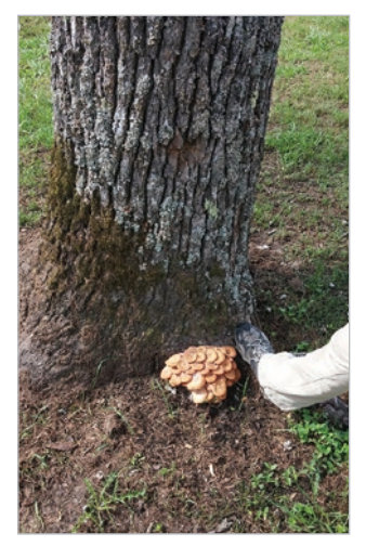
Honey mushrooms at base of tree infected with armillaria root rot.

These common, opportunistic fungi often infect trees that are wounded or stressed. Armillaria root rot is a common contributing factor of oak decline in Virginia.