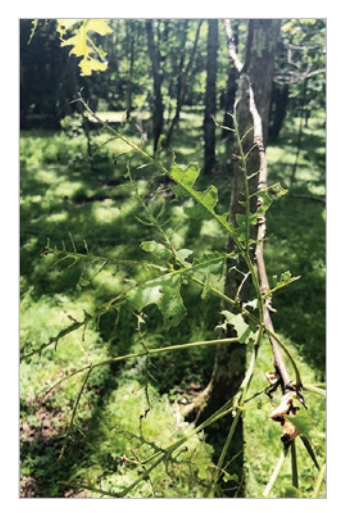
Feeding damage by fall cankerworm.