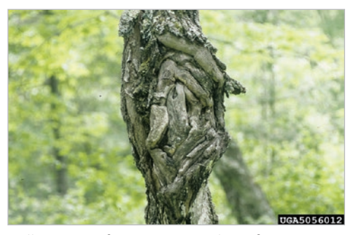
Callous tissue from nectria canker infection.