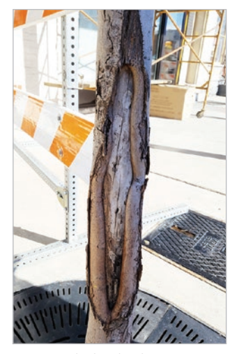
Trees with thin bark are particularly susceptible.