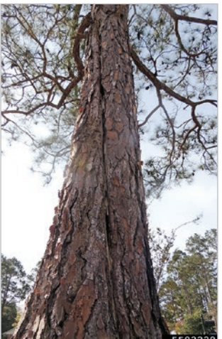
Callused lightning scar.