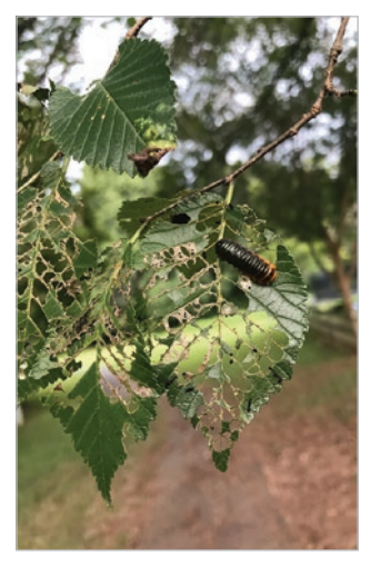
Larger elm leaf beetle larva.