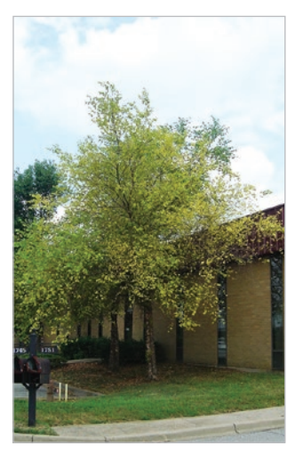
Chlorosis from a nutrient deficiency.