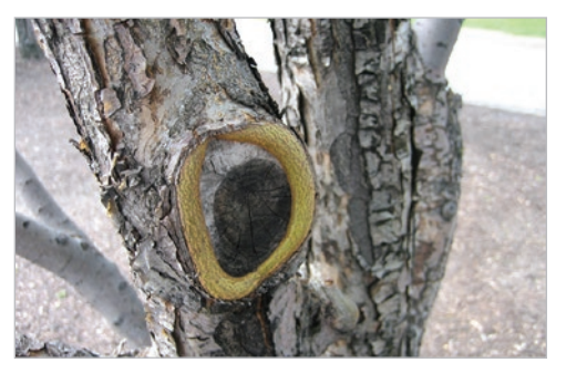
Large pruning wounds expose the tree to stress and decay.

Pruning when the tree is young is the best way to establish proper structure. Identify a dominant, central leader and lowest branch in the permanent canopy. Space main branches intentionally along the central leader. Eliminate any branches that are more than one half of the trunk diameter or with weak branch unions. Suppress branches that grow upright. Pruning cuts should be made just to the outside of the branch collar. Continuously monitor the tree and make adjustments as it puts on growth. Reference ANSI A300 standards on proper pruning.