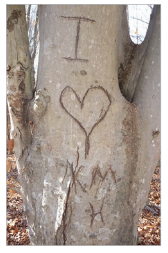
Love notes can have unintended consequences!