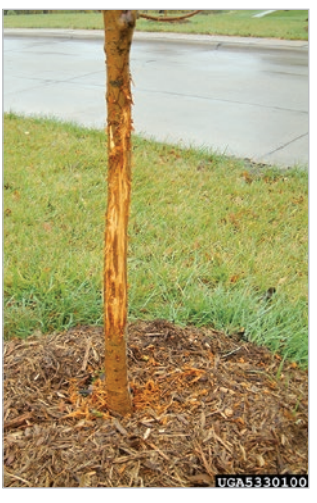
Deer rub damage on bark.