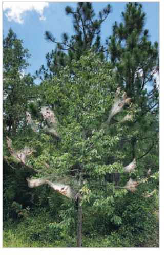
Fall webworm infestation.