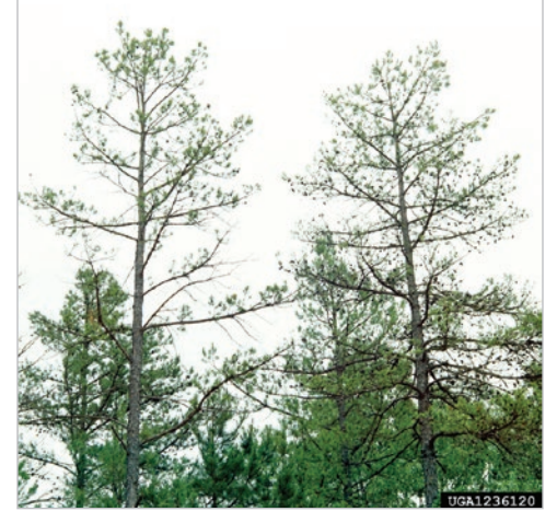
Canopy decline from littleleaf disease.

This is the worst disease to affect shortleaf pine, and contributed to the decline of shortleaf as a major commercial species.