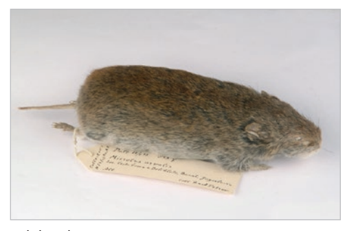
Adult vole.

A combination of habitat reduction, trapping or poison baiting, and predators is the best approach to reducing vole populations. If you're managing trees in a developed area, avoid laying thick mulch flush against the trunk of the tree. This provides