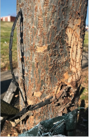
Planting supports left on longer than necessary can embed themselves into the tree.