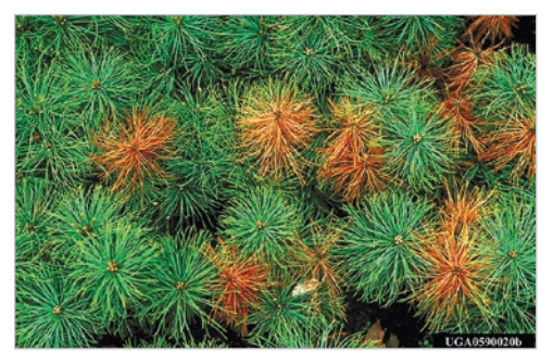
Nursery stock infected with diplodia tip blight.

Maintain tree vigor through adequate watering and fertilization. Scout trees for symptoms and if infection is heavy, treat with fungicide. If only a few trees are infected, prune and remove infected shoots, twigs, branches, and cones during dry weather when fruiting bodies are not releasing spores. Be sure to burn the material you pruned as fungus can persist in dead tree tissue.