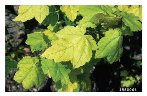
Iron deficiency displays as interveinal chlorosis on new growth and younger leaves.