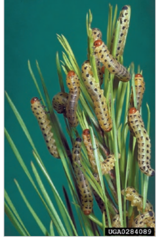
Redheaded pine sawfly larvae.