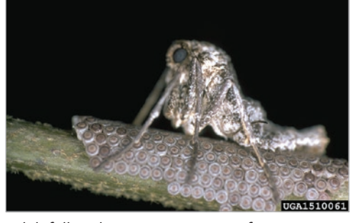
Adult fall cankerworm on a mass of eggs.

The fall cankerworm is often a nuisance pest in urban areas since defoliation can be unsightly, and the dropping of frass and silken strands can be alarming.