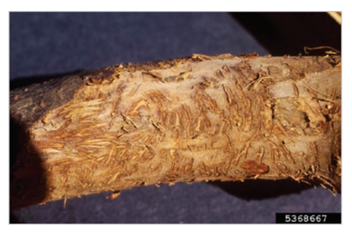
Vole feeding damage.