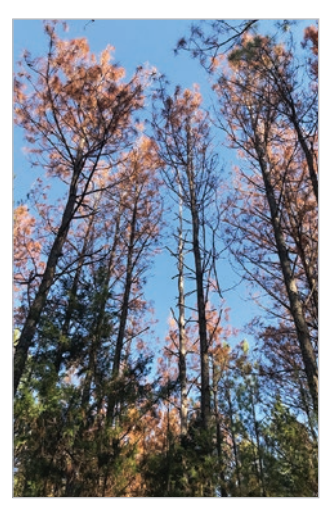
Stand damage from Ips beetles.