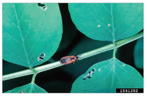
Adult locust leafminer.