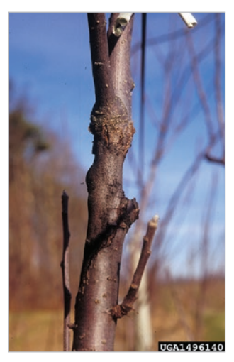
Fire blight branch canker.