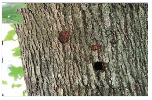
Asian longhorned beetle egg site and exit hole.