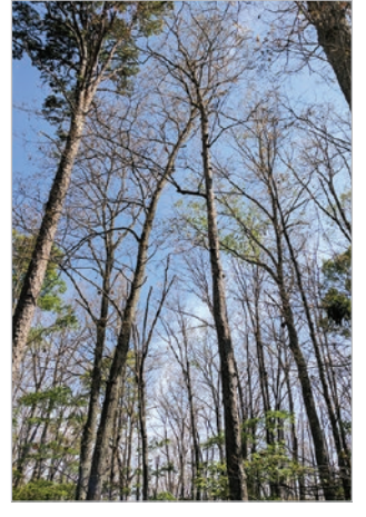
Variable oakleaf caterpillar damage.

Life cycles vary with species, but adults usually emerge midsummer and lay eggs on leaves. Larvae are active in late summer and fall. Pupation generally occurs in winter.