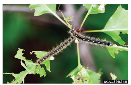
Defoliation caused by the forest tent caterpillar.