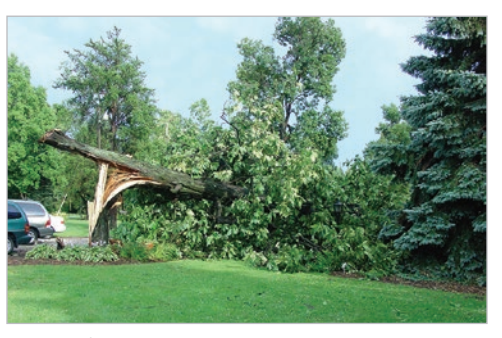
Snapped tree.

Inspect tree for dying, dead, or broken branches and remove them. Prune poor branch attachments and growth habits according to ANSI A300 standards. The establishment of windbreaks or screens can protect sensitive plants. Do not overly thin crowns or top trees to aid in wind movement; this creates openings for pest and disease establishment.