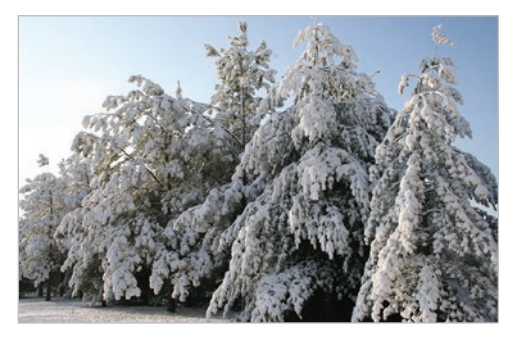
Heavy, wet snow can load down even the most mature of trees.