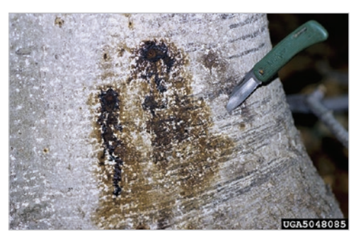
Oozing from cankers.

This is a serious disease to beech trees and causes severe decline and death in both young and mature trees. However, in Virginia, the disease only appears to infect beech trees at elevations greater than 1,000 feet.