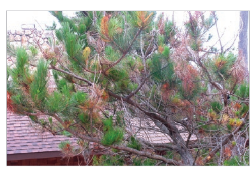
Branch mortality on tree infected with pitch canker.

Usually trees are able to overcome small infections but occasionally the fungus can reach epidemic proportions, especially on younger trees.