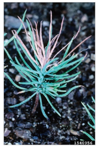
Fertilizer burn on young pine seedlings.