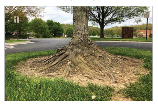
Tree planted to shallow, leaving an exposed and vulnerable root system.