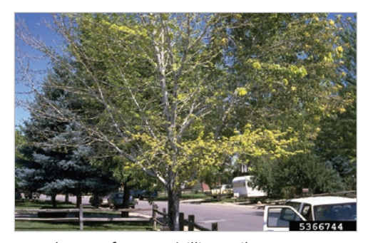
Tree damage from verticillium wilt.