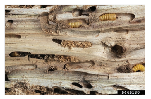
Locust borer tunnels and larvae.