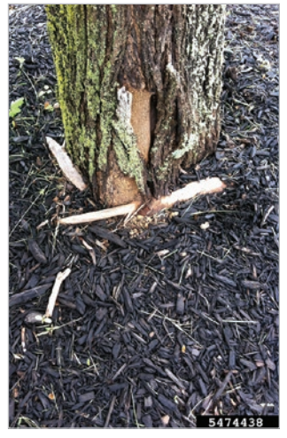
Recently damaged tree base.