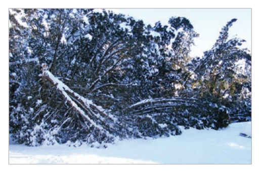
Heavy snow exposes plants to catastrophic damage.