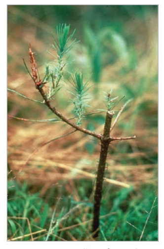
Damage to seedling from deer browse.

Little can be done in natural areas short of installing a deer-proof fence to keep animals out of the area. In landscape situations, foul-smelling sprays (usually sulphur-based) can be effective repellents; these spray-on formulations will need to be reapplied after rains. If appropriate, regulated hunting will lower populations while providing a public resource.