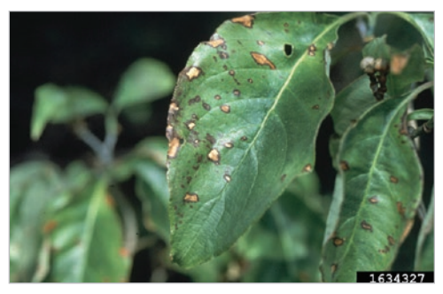
Dogwood anthracnose.

Anthracnose is a group of fungal diseases that affect many species of hardwood trees. In Virginia, the disease is very common on dogwood and sycamore trees.