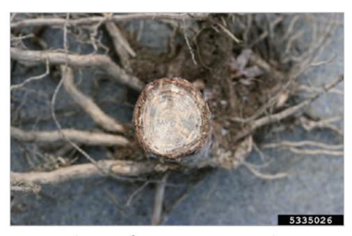
Staining damage from procerum root disease.

Maintain tree health. Fungal spores favor wet environments for dispersal and readily infect stressed trees, so avoid planting on sites that are too wet. Remove and destroy diseased trees and roots and do not replant pines where diseased trees were removed.