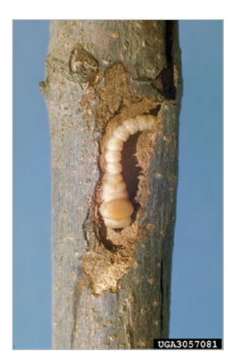
Flatheaded appletree borer larva.

There are several natural enemies, such as parasitoid wasps and woodpeckers, that control this pest. Chemical control is an option for fruit and landscape trees; treat bark of trunk and branches in early May, June, and July. Good cultural control practices, such as mulching, proper irrigation, and fertilization, can also reduce the risk of attack as stressed trees are more likely to be impacted.