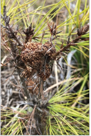
Pine webworm frass and webbing.

The pine webworm is not a serious pest and management is typically not required. Populations are generally controlled by natural enemies. If populations are high and seedling stocking is marginal, you can treat larvae in July to August with a full-coverage spray of insecticide, such as Bacillus thuringiensis .