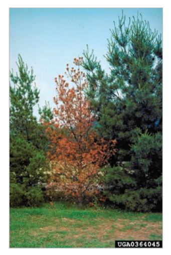
Tree infected with procerum root disease.