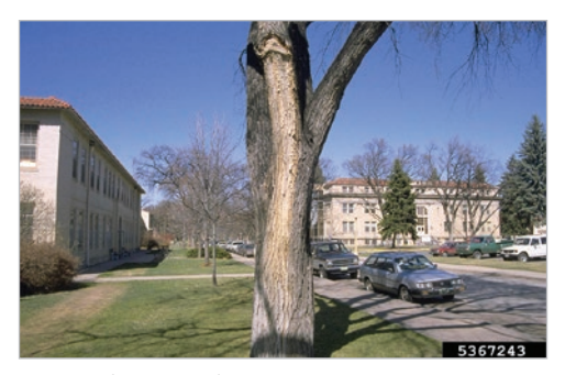
Bacterial wetwood.

Avoid wounding trees and follow proper pruning protocols to ensure that wounds heal and close rapidly. Do not drill holes to "relieve pressure". Fluids can be washed away with a mild soap solution.