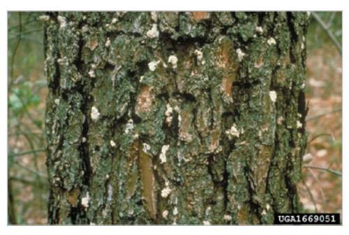
Pitch tubes between bark plates.