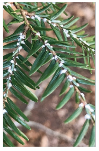
White woolly ovisacs of the hemlock woolly adelgid.