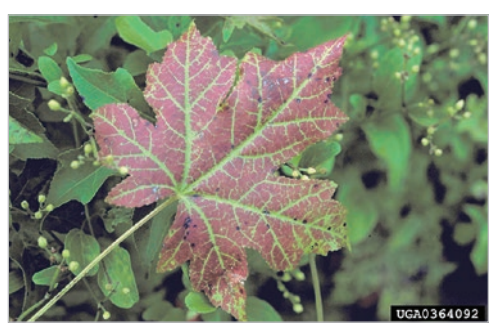
Ozone damage to a maple leaf.