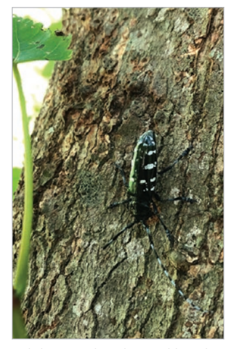
Adult Asian longhorned beetle.

At the time of publication, the Asian longhorned beetle was not yet present in Virginia but has been discovered in other eastern U.S. states.