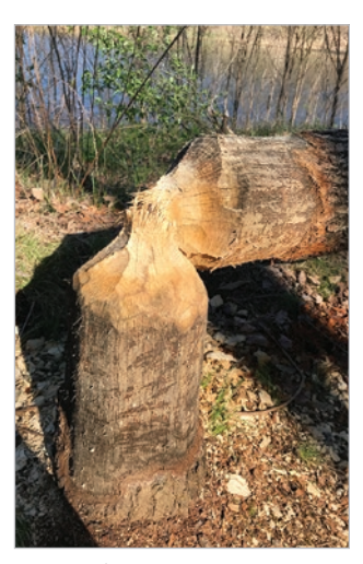
Beaver damage.