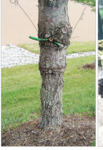
Planting support embedded into the trunk of a tree.