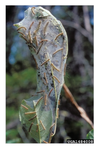
Fall webworm caterpillars within webbing.

Control is usually not necessary but removing and destroying webs may help reduce the population. Physically breaking webs open with a stick will allow predators (e.g., birds, wasps) to access and feed on the larvae. Insecticides can be applied when caterpillars are young, but are not practical on a large scale.