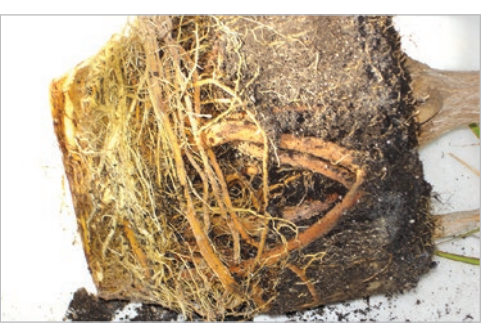
Circling roots can be a result of plant stock being left in a nursery pot for too long.