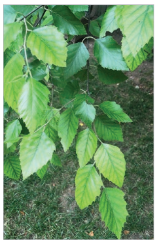
Dark leaf veins against lighter leaf margins is a cause for investigation.