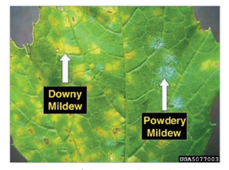
Comparison of downy and powdery mildew.