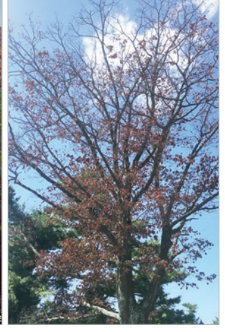
Extensive leaf dieback from drought.