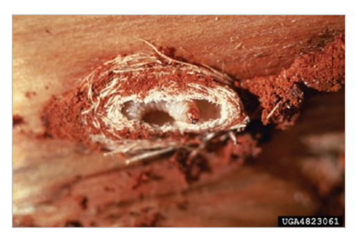
Deodar weevil chip cocoon.

Deodar weevils can be vectors of pitch canker.