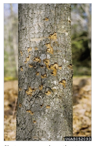
Shotgun spray along the stem of a pine tree.

Management depends on the extent of damage to the tree. Work with a certified arborist to evaluate and monitor. Not all vandalized trees can be saved but educating the public and raising awareness of the issue can discourage vandalism.