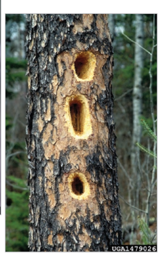
Pileated woodpecker holes.