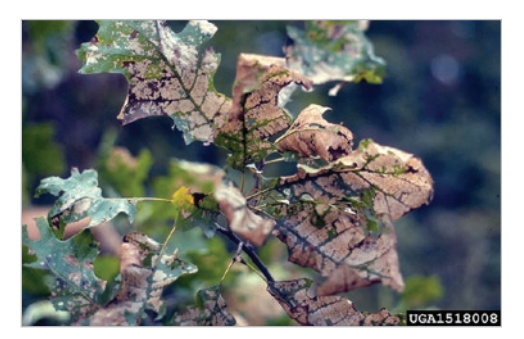
Sawfly damage on oak.