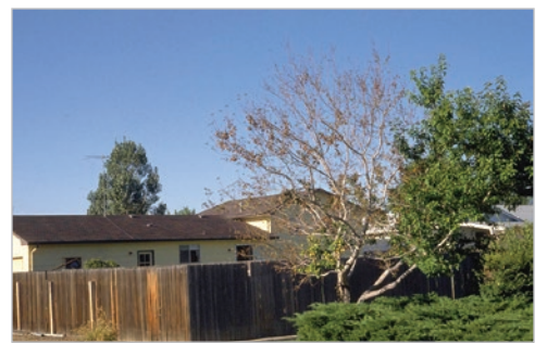
Soil sterilant damage to a tree in a suburban yard.