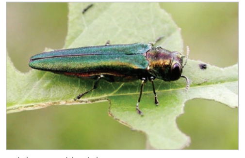
Adult emerald ash borer.

A comprehensive guide for insecticide options for protecting ash trees can be found online here: https:// extension.entm.purdue.edu/EAB/PDF/NC-IPM.pdf.