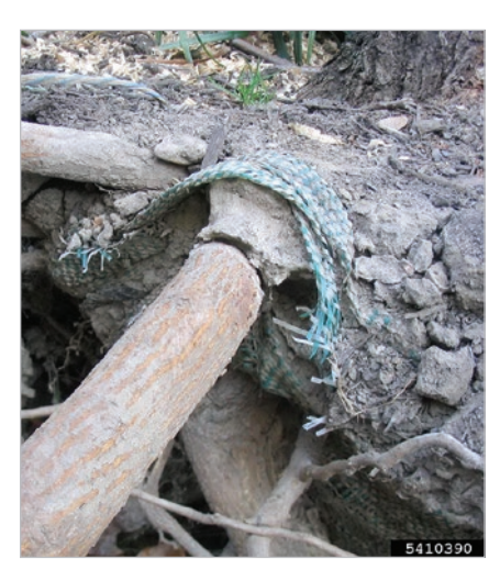
Large roots can be severed by synthetic burlap and wire basket material.

If roots of an already-planted tree have grown through the burlap or wire and have girdled, the tree may need to be removed. When replanting, remove all synthetic or treated burlap and, if possible, remove all of the basket. If needed, the lower one third of the wire basket can be left in place to aid in keeping the root ball intact. Stakes may be needed in the first few years of establishment, but should be removed once the tree has become established.