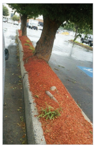
A small parking lot median is an unrealistic choice to grow a healthy, large specimen