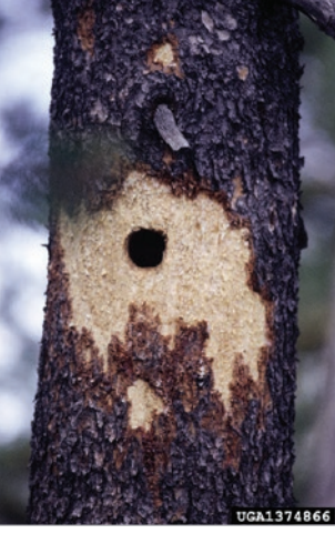
Woodpecker hole.