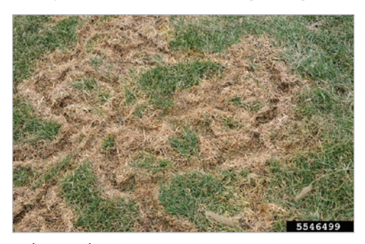
Vole tunnels.

desirable vole habitat that allows them to burrow up to the tree to feed. Continue to monitor vole sites in early spring and again each fall to detect populations before plants are damaged.