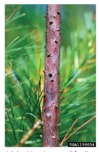
Adult white pine weevil feeding holes.