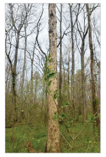
Woodpecker stripping.