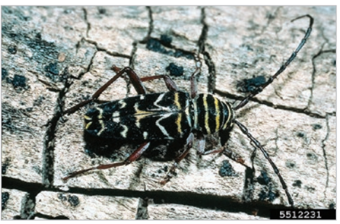
Adult locust borer.

Systemic insecticides can be applied preventatively as soil drenches before infestation occurs. Apply these in early spring. Otherwise, treat the trunk and larger branches in late August to mid-September with contact insecticides. Natural predators of the locust borer are woodpeckers and wheel bugs.