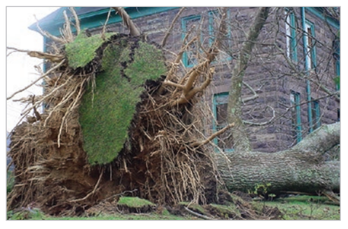
Large tree uprootted in Big Stone Gap.