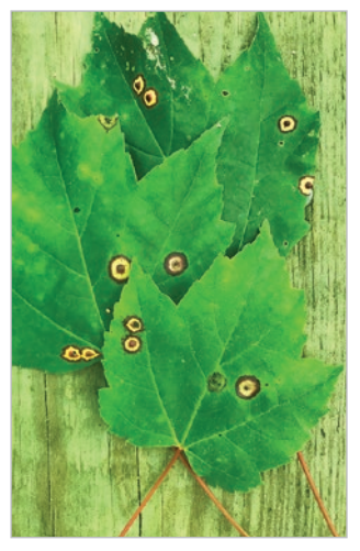
Leaf spot.