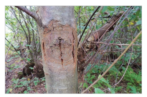
Canker on a chestnut stem.

The American chestnut was once a dominant tree species in North American forests. Chestnut blight was introduced to North America in the early 1900s and has functionally eliminated American chestnut from the landscape.