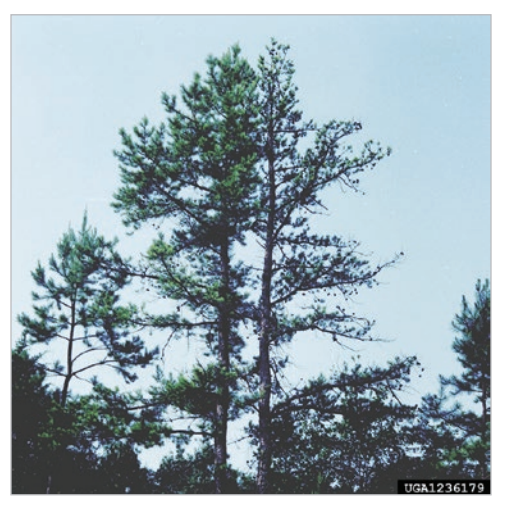
Tree infected with littleleaf disease.