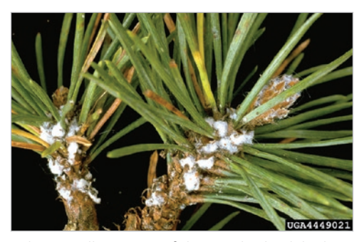
White woolly coating of the pine bark adelgid on a branch.

Control is not warranted for light or moderate infestations. Natural predators usually keep pine bark adelgid populations low. In heavy infestations, horticultural oil and insecticidal soaps may be applied in the early spring before crawlers mature and lay eggs. If this does not provide adequate control, registered contact and systemic insecticides are available.