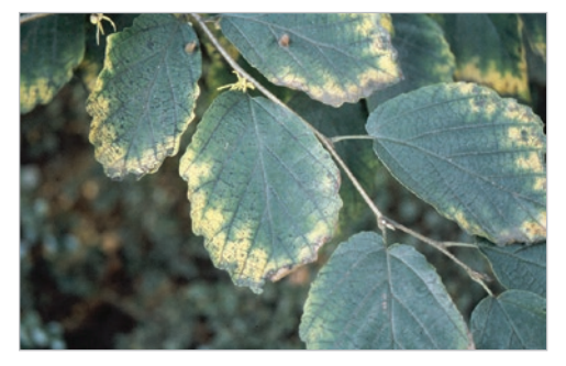
Herbicide toxicity on witchhazel.