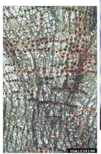
Sapsucker feeding holes.

No management necessary. Standing dead trees are good habitat for woodpeckers.