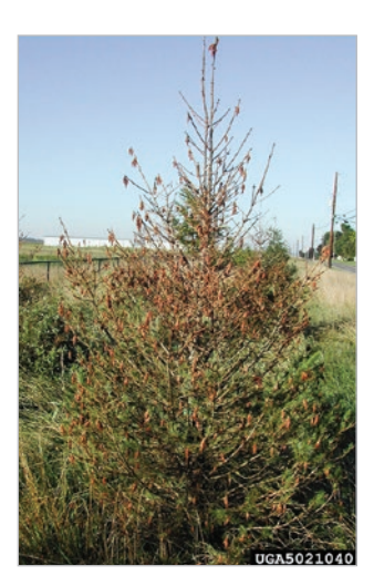
Tree damaged by bagworms.