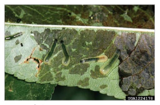
Pear sawfly larvae.

There are many species of sawflies that attack deciduous trees and shrubs in Virginia including the oak, pear, dogwood, and rose slug sawfly.