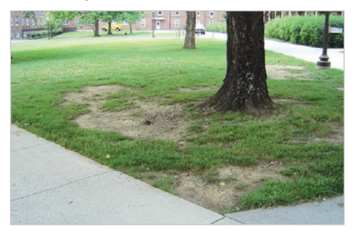
Patchy turf in high-traffic areas is another sign of compaction.