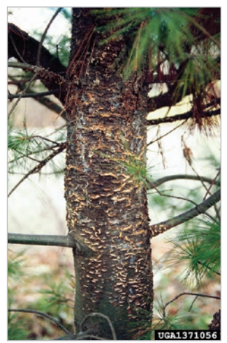
Blister rust spore stage.