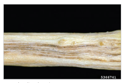
Vascular discoloration.