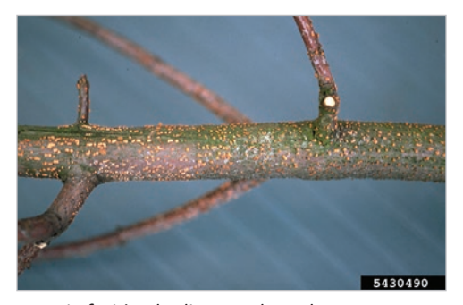
Nectria fruiting bodies on a branch.

Avoid wounding the tree, prune out branch cankers, and sterilize pruning tools during dry periods when spores are less abundant. Only prune limbs in dry weather; if limbs are pruned during wet autumn weather, Nectria can readily invade the wound.