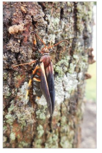
Adult lilac borer.