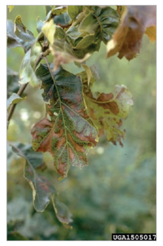
Sulfur dioxide injury to oak leaves.

Select tolerant species for areas prone to phytotoxic levels of pollution. Plant sensitive species away from areas of concentrated pollution.