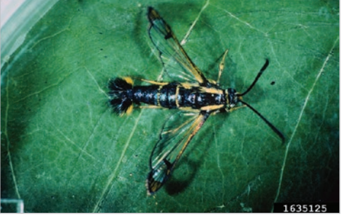
Adult dogwood borer.