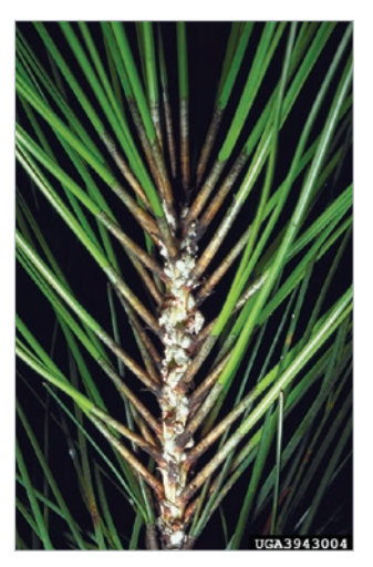
Mealybugs clustered on pine.

Mealybugs are difficult to manage with insecticides, since they are continually producing new generations in high numbers. Fortunately, most species are controlled by natural enemies. It's best to avoid using broad-spectrum insecticides to preserve these natural enemy populations. If infestations are particularly bad, insecticidal soaps, horticultural oil, or neem oil insecticides applied directly on mealybugs can provide some suppression, especially against younger nymphs that have less wax accumulation.