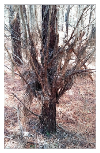
Pine deformity from fusiform rust.