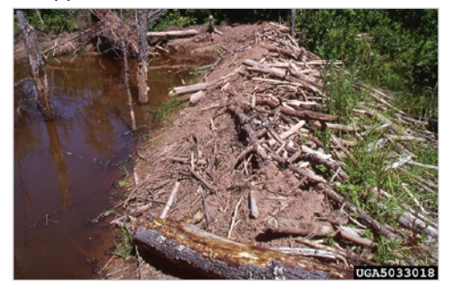
Beaver dam.

Beavers fulfill an important role in creating wetlands and providing new habitat for a variety of wildlife. If damage is light, it is best to leave them alone. Preventative measures can be taken to protect valuable trees, especially if the property is shore-lined. Wrapping valuable trees with hardware cloth or heavygauge woven wire fence can deter beavers. Make sure to leave enough room for tree growth (1 to 2 inches) and wrap at least 3 feet tall. Repellent is available and most effective when used at the first indication of beaver presence or in areas where beavers are most actively feeding. This bitter tasting liquid can be painted or sprayed on trees. Frequent reapplication will likely be necessary to maintain control. To remove dams or control population levels, first contact your local game warden at the Virginia Department of Wildlife Resources. State regulations may limit the types of traps, trapping methods, and seasons in which beavers may be trapped or shot.