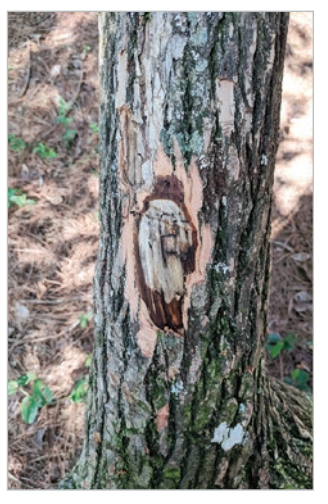
Vascular streaking from laurel wilt disease.