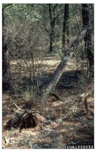
Windthrown tree in stand infected with heterobasidium root disease.