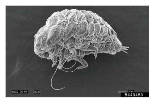
Magnified view of a hemlock woolly adelgid.

The hemlock woolly adelgid is native to Asia and western North America, but invasive in eastern North America. The adelgid does not cause mortality to hemlocks in its native range, only eastern and Carolina hemlocks in the east are susceptible.