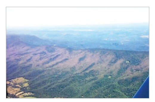
Gypsy moth-defoliated ridgetops.

The gypsy moth is invasive in North America. It was introduced from Europe in the mid-1800s and has defoliated hardwoods in Virginia since the 1980s.