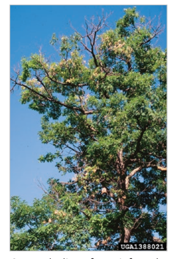
Crown decline of tree infested with two-lined chestnut borer.