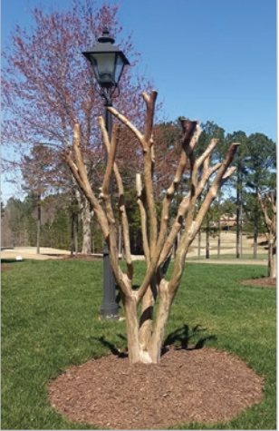
Repeated topping will eventually kill the tree.