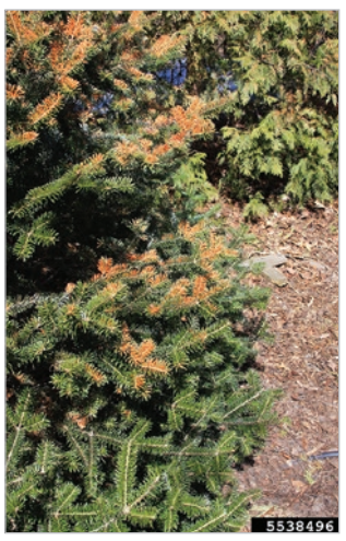
Discolored or "burned" needles in evergreens are a common result of cold injury.