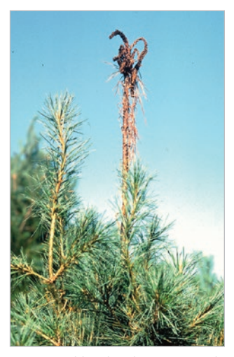
Damaged leader due to weevil feeding.