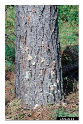
Pitch tubes at base of tree.