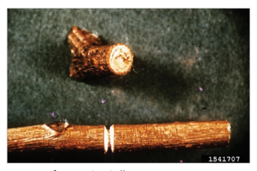
Damage from twig girdler.