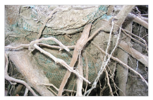
Roots struggle to grow through burlap that was left on the root ball of tree during planting.