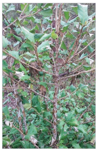
Numerous small slits on bark and leaves following a hailstorm event.