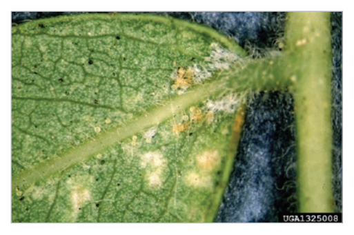
Magnified view of mites and leaf damage.

Spider mites are common pests in greenhouse environments.