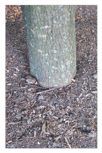
Soil piled up to the base of the tree; root flare is buried.

If the tree is planted too deep, pull all soil away from the trunk of the tree until you reach the first few large roots and expose the root flare. If the tree is planted too shallow, gradually build up the grade around the tree with soil rich in organic matter, no more than 1 inch per year. When planting a tree, identify the root flare and dig a shallow, broad hole that is two to three times the width of the root ball. The hole should only be as deep as the current root ball. Remember, most of the tree's roots are found in the top 18 inches of the soil.