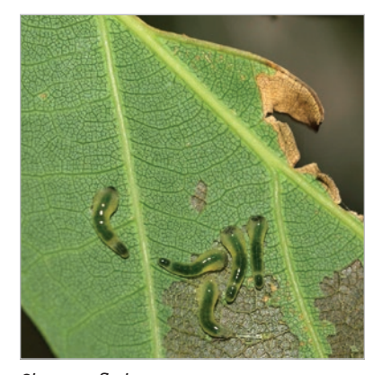
Slug sawfly larvae.

Adult sawflies are inconspicuous and shortlived. Females lay eggs in slits sawed into leaves or stems. Larvae are usually present in early summer when they feed in groups for approximately a month before pupating. The number of generations per year varies by species.