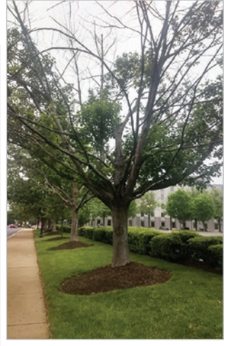
Branch dieback on a declining 5454686 tree.