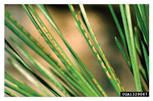
Sawfly eggs laid on pine needles.