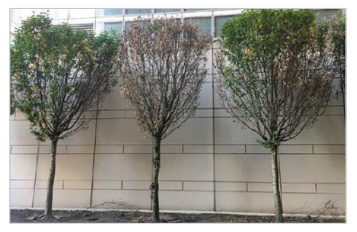
Crown dieback and thinning canopy are obvious signs of too much water.