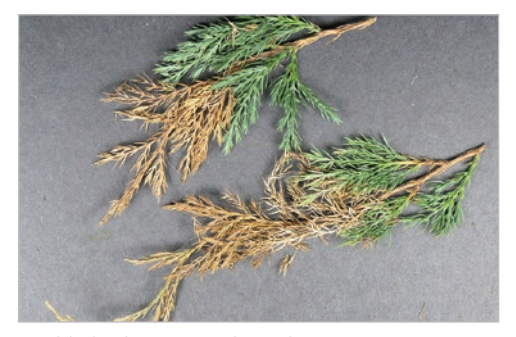
Tip blight damage on branches.