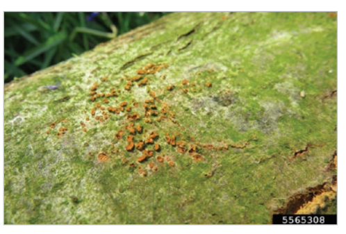
Fruiting bodies of chestnut blight.