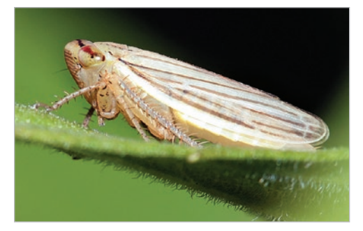
Adult leafhopper insect.