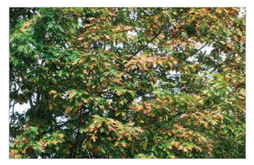
Oak infected with bacterial leaf scorch.