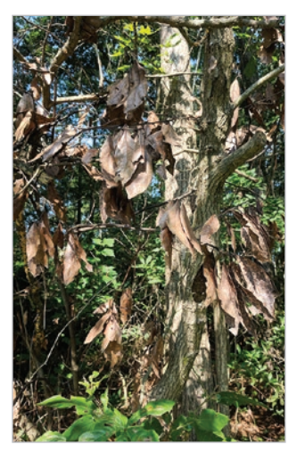
Redbay infected with laurel wilt disease.

Laurel wilt disease is not yet present in Virginia, but is spreading to new territory rapidly. Diseased trees have been confirmed in neighboring states KY, TN, and NC.