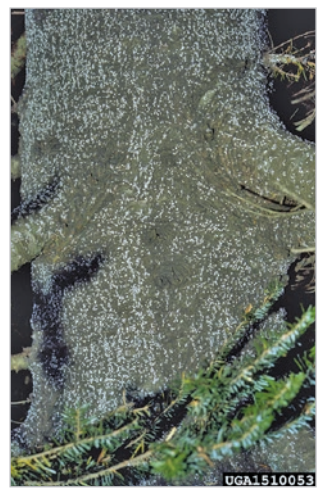
Trunk infested with balsam woolly adelgid.