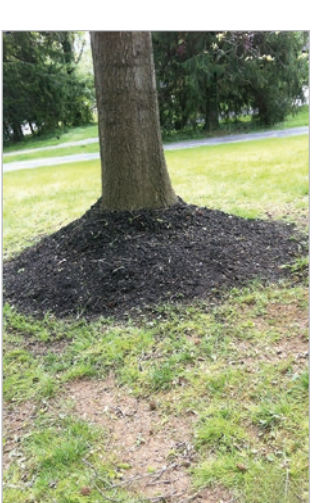
Volcano mulching exposes the tree to the risk of rot among other negative unintended consequences.