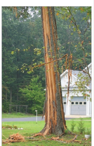
Bark blown off a tree from lightning.

Wait a full growing season to determine the extent of damage. Prune broken branches and remove loose bark. Ensure tree is properly watered and mulched to encourage recovery. Lightning protection systems can be installed to protect trees in advance of a lighting strike.