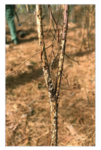
Pales weevil feeding damage.