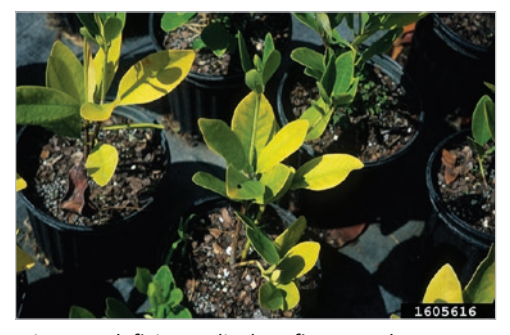
Nitrogen deficiency displays first as pale greenyellow chlorosis on older leaves.