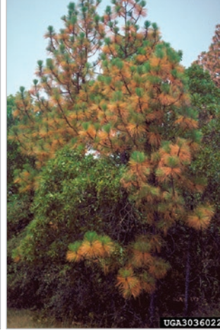
Drought damage on pine.