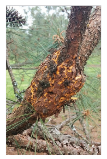
Fusiform rust on canker in the spring.

In Virginia, fusiform rust is historically found only in the Southeast; however, the range may be expanding. In general, fusiform is favored by warm, wet weather and occurs most often in well-drained, sandy loam soil.