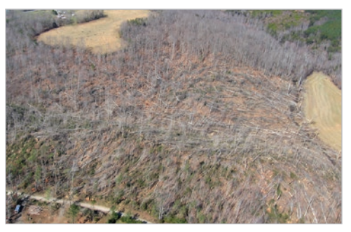
Tornado damage.