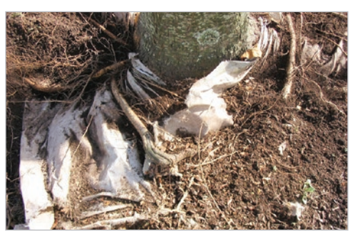
Root barrier struggles to stretch as the tree grows with age.