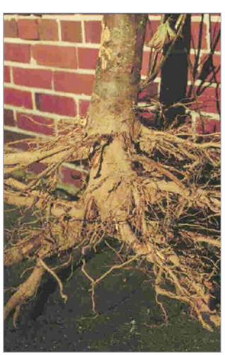
Volcano mulching encourages more lateral root growth into the mulch and not down into the soil.