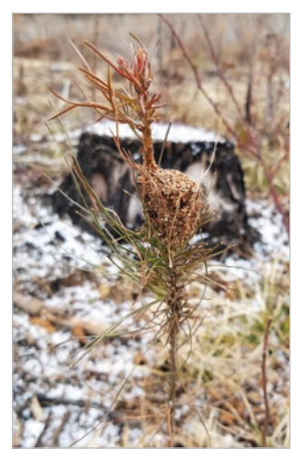
Pine webworm frass and webbing.