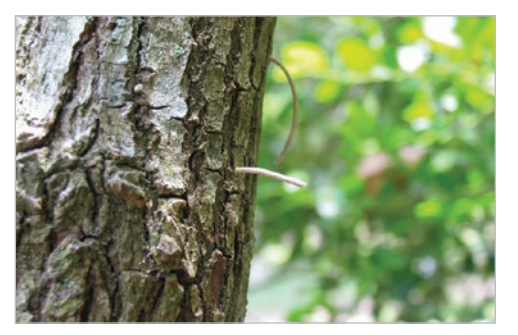
Frass toothpick.