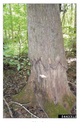
Tree stripped by beavers.