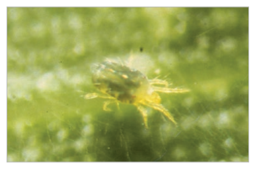
Adult mite.