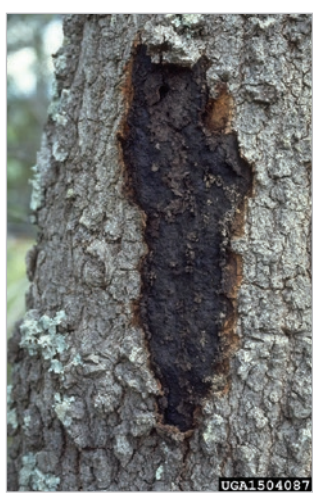
Later stage fungal mat.