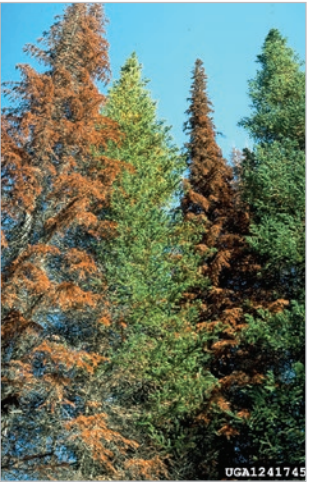
Trees killed by balsam woolly adelgid.