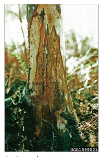
Canker and resinosis.