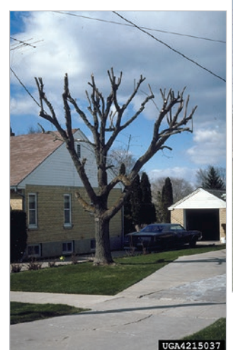
Trees and powerlines do not mix!

When planting a tree, keep its expected height at maturity in mind. Crown reduction pruning can be performed to reduce the overall height of the tree. This method prunes large branches back to laterals that are at least one third of the diameter of the branch that is being removed. Proper crown reduction pruning reduces the likelihood of watersprouts and weak branch unions. A mature tree should be assessed and pruned on a three- to five-year cycle to ensure proper structure is maintained. Prune without cutting into the branch collar and without leaving a stub. If the tree has already been topped, assess it for decay and elevated pest activity. Pay attention to new branches that form and prune out any with weak unions. Topped trees can be corrected over time with repeated restoration pruning. Ensure the tree is properly mulched and watered to minimize additional stress. Sometimes a tree cannot be saved – this determination can be made by a certified arborist.