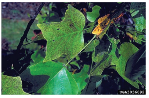
Pollution particulates collected on a tulip-poplar leaf.