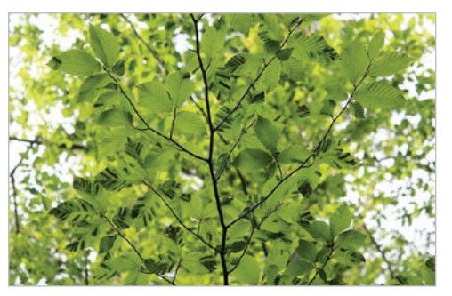
Beech leaf disease banding viewed from below.