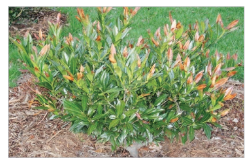
Newest leaves are more tender and discolor first on the plant.

Choose trees to plant that are appropriate for the hardiness zone. Allow cracks and discolored areas to heal naturally. Select species with thicker bark in areas with south/ southwest sun exposure. Protect the bark of sensitive trees with a temporary seasonal wrap. Do not prune a cold-injured plant until the extent of the damage is entirely known because it may produce new foliage or resprout. Keep the damaged tree well-watered.