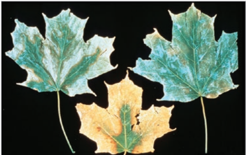
Foliar symptoms of verticillium wilt.

Since tree-of-heaven is an invasive plant, verticillium wilt is often considered a form of biological control when it infects this tree species.