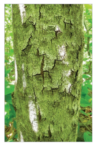
Beech tree infected with beech bark disease.