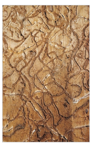
Southern pine beetle bark galleries.