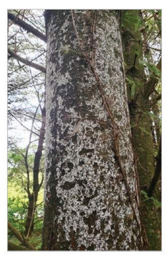
Eastern white pine infested with pine bark adelgid.