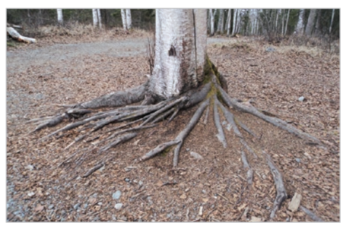
Girdling roots constrict a tree base.

Remove or sever the object that is causing the girdling. Remove all deadwood from the tree and ensure that it is properly watered. If the object cannot be removed, add a thick layer of mulch towards the dripline of the tree. Ensure that the mulch does not touch the trunk.