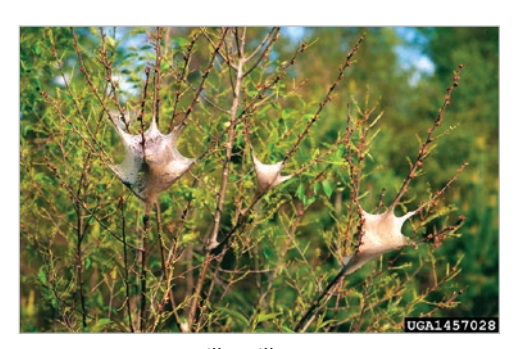
Eastern tent caterpillar silken tents.

The eastern tent caterpillar is often confused with the forest tent caterpillar. Eastern tent caterpillars have blue, black, and orange markings and a solid white line running down their back.