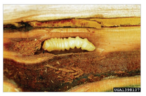
Asian longhorned beetle larva.