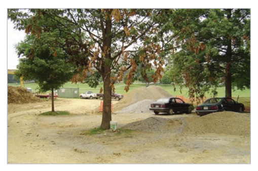
Top soil removed and subsoil compacted around the bases of the tree.

Prevent soil compaction by installing barriers, such as fencing, around trees. Mulch the critical root zone of the tree (from trunk to dripline) and avoid working with wet soils. Soil amendments, aeration, and air excavation are options for loosening soil on existing sites. Maintaining soil organic matter at a high level will help preserve soil structure against compaction.