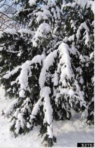
Evergreen snow load.