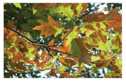
Bacterial leaf scorch foliar symptoms.

Xylem-feeding insects, primarily leafhoppers and spittlebugs, spread the bacteria when they feed on trees.