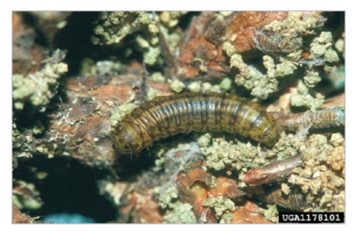
Pine webworm larva.