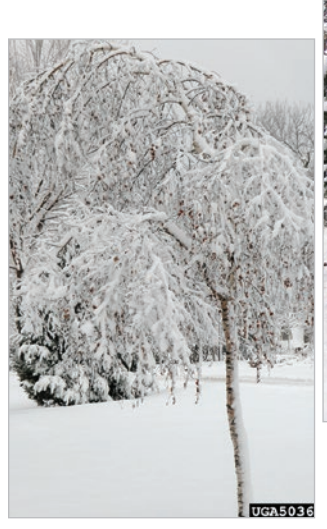
Deciduous snow load.

Wait until the ice/snow has fully melted from the tree before taking action. Prune torn branches and bark as soon as it is safe to do so. Trees with 75 percent canopy still intact are expected to recover over time. Properly pruning trees will result in a tree more resilient to adverse weather systems. Young trees are most susceptible to hail damage but tend to bend and recover when faced with ice accumulation. Reference ANSI A300 standards for proper pruning techniques.