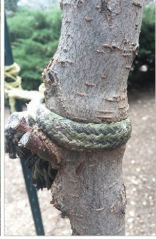
Rope constricts a young tree.