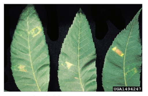
Leaves with aphid damage.

Aphids are small, soft-bodied insects that have two small protrusions called cornicles on the back end of their abdomen.