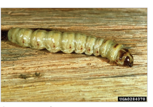
Carpenterworm larva.