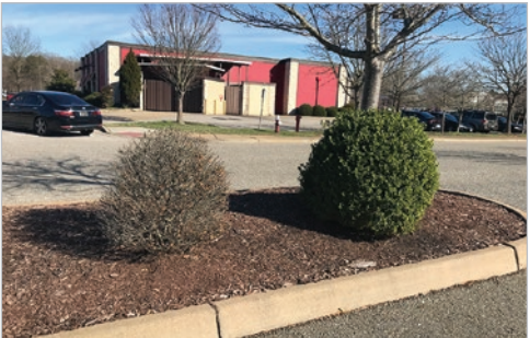
Same species, planting site, and planting time with different results.

Inspect plants before planting for new growth and vibrant color. Choose or prepare trees for transplant with adequate root ball diameters – a minimum of 10 times the diameter at breast height. Ensure roots of the plant are white and healthy. Plant during cooler months when trees are dormant and less likely to experience stress. Continuously monitor new plantings to ensure their watering and management requirements are being met.