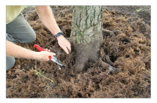
Pruning away adventituous roots that have formed above the root flare.