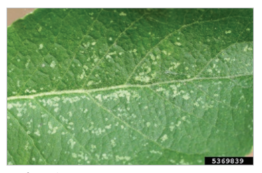
Leaf stippling.

These insects can transmit bacterial leaf scorch.