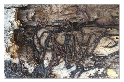
Black rhizomorphs under bark.