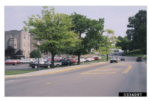
Tree showing signs of chlorosis along a roadway.

Perform a soil test or foliar nutrient test to determine pH value and what supplemental nutrients are needed. If the soil pH is not between 5.5 and 7.0, nutrient availability decreases. There could also be an overabundance of specific nutrients resulting in toxicity damage to the plant. Administer soil amendments as needed. Choose plants that are adapted for the type of soil on site. Lowering pH is more difficult than raising pH.