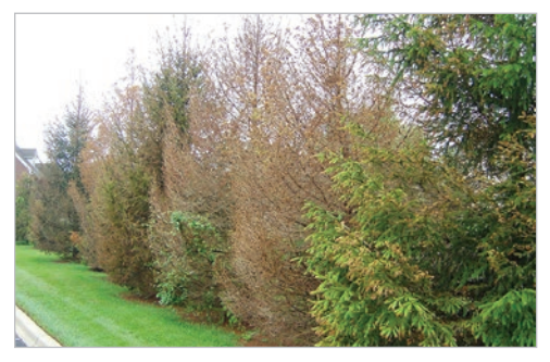
Line of pines with needles burnt due to herbicide drift from neighboring property.

Trees are most susceptible in the spring when they are leafing out. Follow the product label and limit application to days and seasons that are cool with low wind speed to decrease the likelihood of volatilization. Pay attention to surrounding properties with sensitive vegetation – gardens, vineyards, etc. Adjust spray nozzles to a coarser setting. When possible, use alternative weed control tactics such as mulching or weeding.