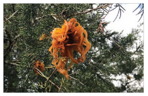
Orange telial horns emerging from a gall on cedar.

Remove alternate hosts to prevent inoculation of cedar trees. If infestation is light, prune out affected branches with galls on cedar trees in the winter before telial horns have emerged. Preventative fungicides can be applied to cedars and apple trees.