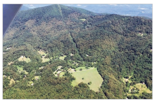
Aerial photo of yellow-poplar weevil outbreak.