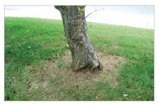
Misformed tree base due to repeated mower damage.