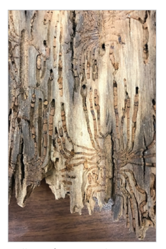
Galleries from tunneling hickory bark beetles.