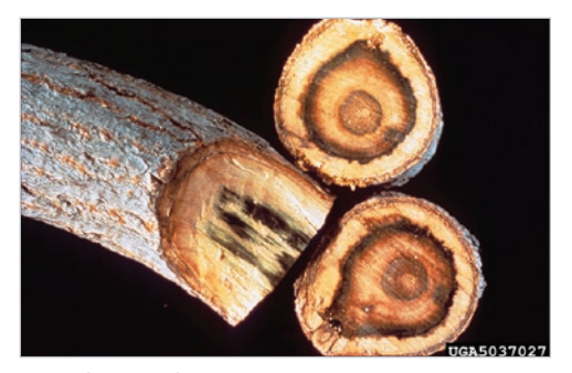
Vascular streaking.