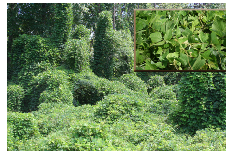
Kudzu ( Pueraria lobata )