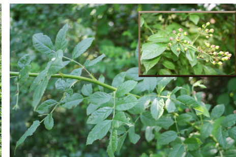
Multiflora Rose ( Rosa multiflora )