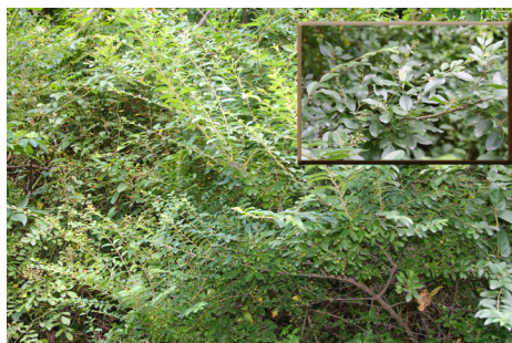
Chinese Privet ( Ligustrum sinense )