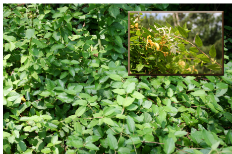
Japanese Honeysuckle ( Lonicera japonica )