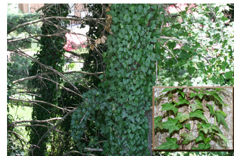
English Ivy ( Hedera helix )