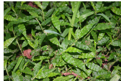
Wavyleaf Basketgrass ( Oplismenus hirtellus ssp. undulatifolius )