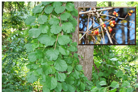
Oriental Bittersweet ( Celastrus orbiculatus )