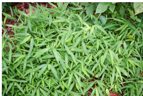
Japanese Stiltgrass ( Microstegium vimineum )