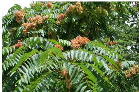
Tree-of-Heaven ( Ailanthus altissima )